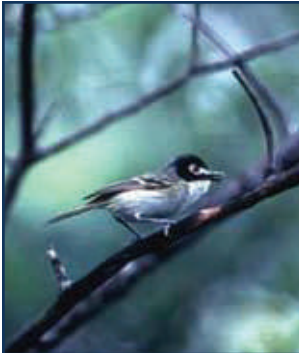
Black-Capped Vireo

These projects assessed the impact of sea level rise and associated storm surges on barrier islands and marshes. They developed tools to show how climate change and variability may affect habitat and population dynamics for bird populations in Florida. These tools also can evaluate assisted migration and colonization for plant species subject to increased storm surge levels, and assess whether