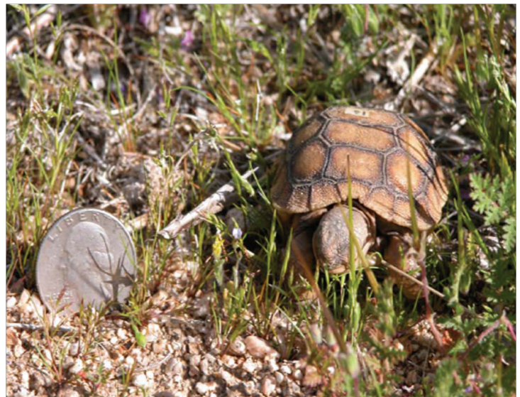
Desert Tortoise Hatchling