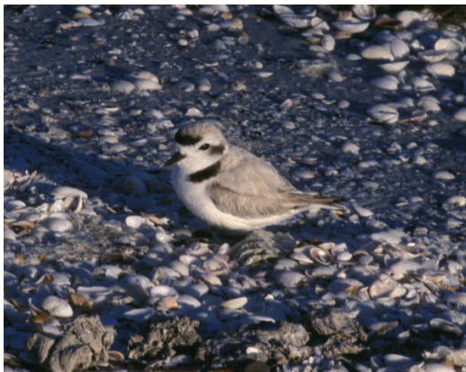
Snowy Plover

Researchers evaluated the impacts of climate and vegetation changes, land-use change, training maneuvers, land and pest management, and other stressors to species living on military installations. The project developed a flexible population model with climate change projections and anticipated changes in the dominant vegetation types for three installations. DoD will use this modeling tool to conduct risk assessments for imperiled species on military lands across the country.