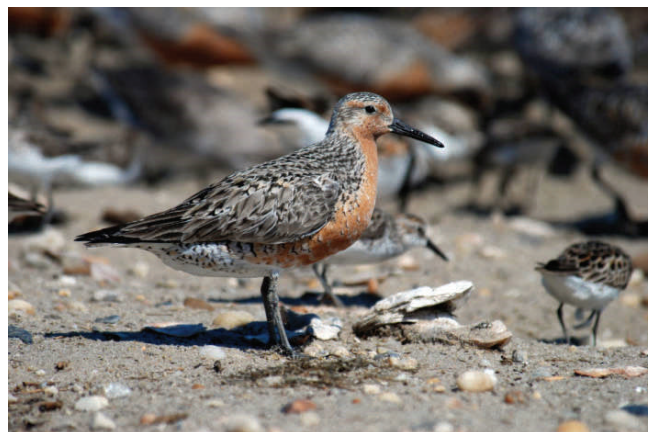
Red Knot

These models predict and map how climate change may alter vegetation and bird distribution on DoD lands in California. Vegetation and bird losses are projected to be much greater on DoD lands than on other public lands in California since birds and vegetation are significantly more abundant and diverse on DoD lands. If regional climate changes result in declines of already sensitive species on military installations, those species could become listed as endangered, which could potentially halt military training.