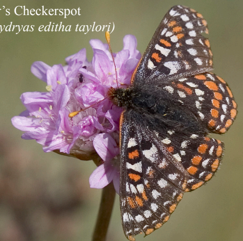
Taylor's Checkerspot ( Euphydryas editha taylori )

This brochure presents conservation resources and incentives, including funding programs, tax benefits, and assurances available to private landowners.