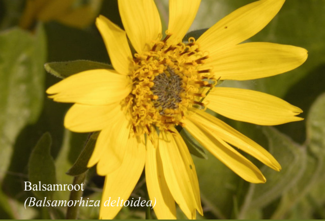
Balsamroot ( Balsamorhiza deltoidea )