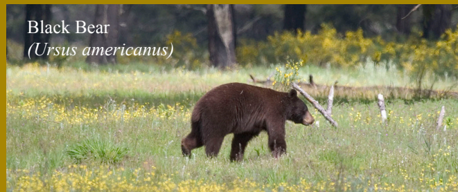
Black Bear ( Ursus americanus )