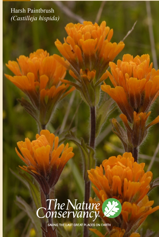
Harsh Paintbrush ( Castilleja hispida )