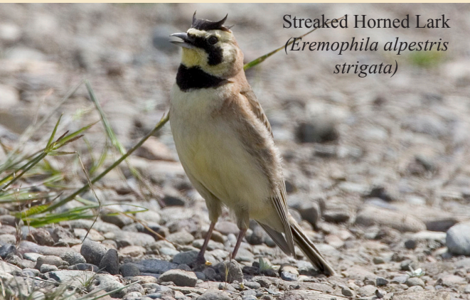
Streaked Horned Lark ( Eremophila alpestris strigata )

Private property owners may face land use restrictions if species found on their lands become listed under the Endangered Species Act in the future. Like the Safe Harbor Agreement, the CCAA is a voluntary agreement between property owners and the US Fish and Wildlife Service to promote candidate species conservation on their lands and waters. USFWS can provide technical assistance in the development of these Agreements.