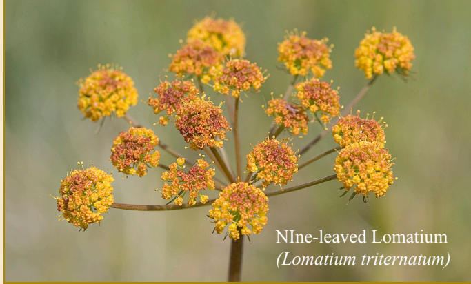
Nine-leaved Lomatium ( Lomatium triternatum )