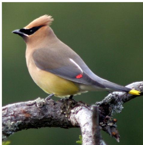
Cedar Waxwings range throughout North America. DoD lands may be most important during the non-breeding season when winter irruptions drive this and other Boreal species into the Lower 48 states.

species of concern database helps installation managers identify priority bird species on every military installation to better focus monitoring efforts.