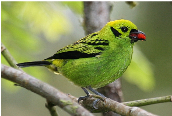
Many migratory birds that breed on DoD lands compete for resources during the non-breeding with tropical species like the Emerald Tanager. The need for full life-cycle stewardship of migratory birds—conserving birds throughout their annual cycle of breeding, migration, and non-breeding—cannot be overstated.

Educating both the military and the public is a vital function of the DoD PIF program. Outreach materials were produced, presentations and briefings were given, and articles were written. Ongoing support of International Migratory Bird Day links international outreach materials and events with local military communities. DoD PIF Representatives attend birding festivals and Earth Day events at military bases and other locations throughout the year. We are constantly confronted with the statement, "I didn't know DoD cared about birds or the environment!" Outreach remains a critical element of the success of all DoD natural resource programs. To form successful partnerships for conservation, the first step is educating potential partners about your priorities and what you do. DoD is committed to conservation birds and their habitats on DoD lands around the country and throughout the world.