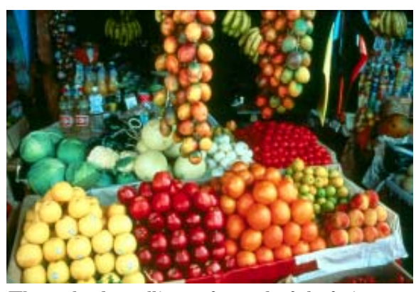
We can thank a pollinator for much of the fruit we eat

According to the United States Department of Agriculture, "we are facing an impending pollination crisis in which both wild and managed pollinators are disappearing at alarming rates owing to habitat loss,