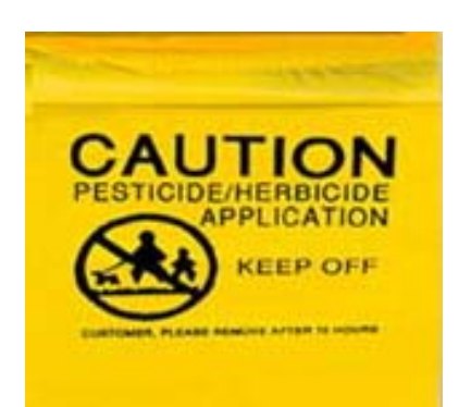
Pesticide and herbicide applications harm native pollinators

exposure to toxins from pesticides and other chemicals can poison or impair pollinator reproduction. These chemicals can eliminate nectar sources and deplete nesting material for bees. Pesticides are not only applied in agricultural