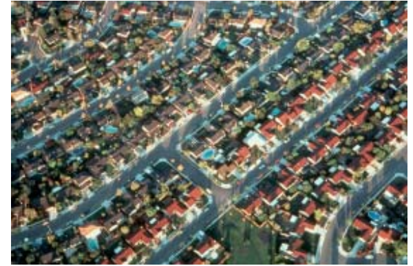
Urban sprawl, anywhere U.S.A.

<u>Habitat</u> <u>destruction &</u> <u>fragmentation:</u> Every day native plant communities and habitat gives way