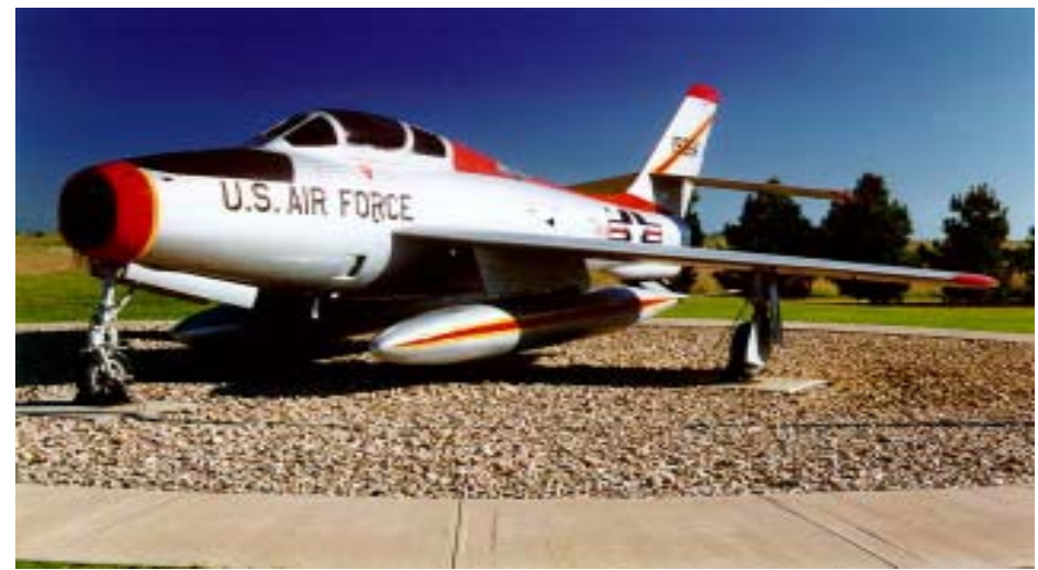
F-84F Thunderstreak, DAFB

Dyess Air Force Base provides 4 study areas in which to restore habitat through the removal of invasive species and augmentation of native plant and native bee species. Two of the plots are adjacent to publicly utilized areas and will be used as an instructive setting for the understanding of habitat restoration techniques and goals, the importance of native insect pollinators, and in providing information concerning the destructive role of invasive plant species on ecosystem health. The other two plots will serve as the base natural resource managers training ground.