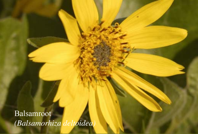
Balsamroot ( Balsamorhiza deltoidea )