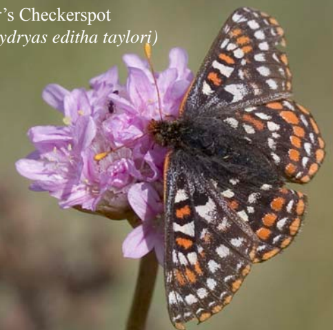
Taylor's Checkerspot ( Euphydryas editha taylori )

This brochure presents conservation resources and incentives, including funding programs, tax benefits, and assurances available to private landowners.