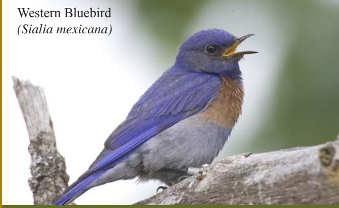
Western Bluebird ( Sialia mexicana )