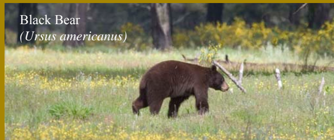
Black Bear ( Ursus americanus )