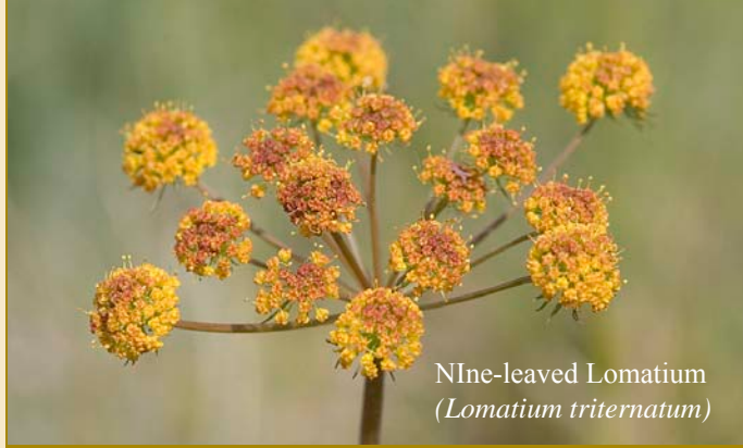
Nine-leaved Lomatium ( Lomatium triternatum )