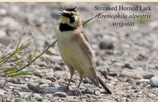
Streaked Horned Lark ( Eremophila alpestris strigata )

Private property owners may face land use restrictions if species found on their lands become listed under the Endangered Species Act in the future. Like the Safe Harbor Agreement, the CCAA is a voluntary agreement between property owners and the US Fish and Wildlife Service to promote candidate species conservation on their lands and waters. USFWS can provide technical assistance in the development of these Agreements.