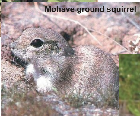
Mohave ground squirrel

For purposes of this research, species at risk are defined as: 1) plant and animal species not yet listed as threatened or endangered under the Endangered Species Act, but are designated as candidates for listing or are considered imperiled or critically imperiled throughout their range, and 2) have populations known to occur on or within 2 km of DoD installations.