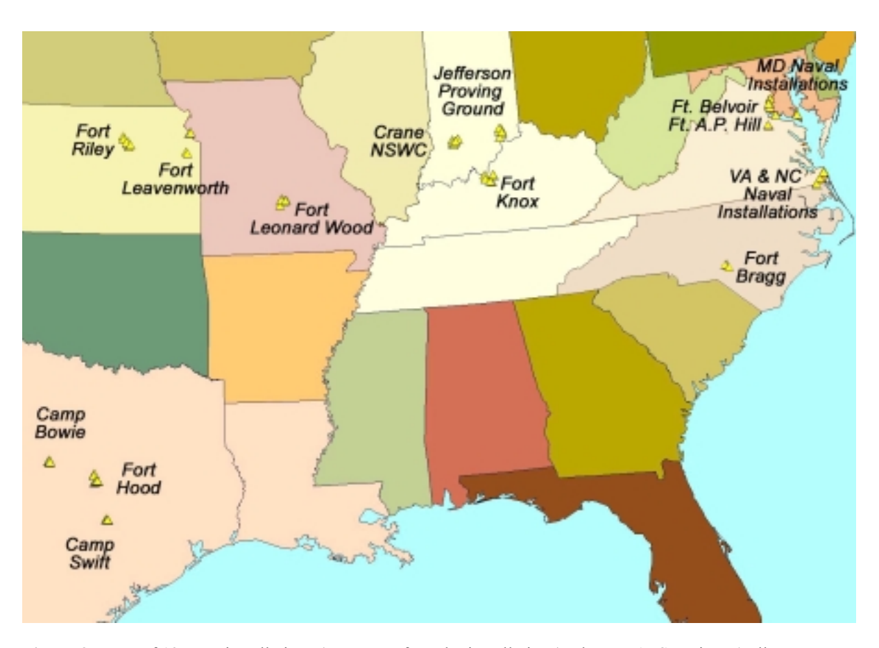
Figure 3 . Map of 13 DoD installations (or group of nearby installations) where MAPS stations (yellow triangles) operated in Maryland, Virginia, North Carolina, Indiana, Kentucky, Missouri, Kansas, and Texas.

We mapped the geographic locations of 78 MAPS stations that operated 1994-2002 (Table 1; Figure 3; the three stations that operated for only one or two years were ignored) onto portions of the NLCD coverage in which the stations are located. Around each station we spatially analyzed a circular area of the reclassified NLCD data using Arcview 3.2 (ESRI 1996) in conjunction with the Patch Analyst 2.2 extension (McGarigal and Marks 1994, Elkie et al. 1999). We also mapped the locations of six new MAPS station established in 2003 or 2004 on Fort Bragg, Jefferson Proving Ground, Fort Knox, Fort Leonard Wood (2), and Camp Swift.