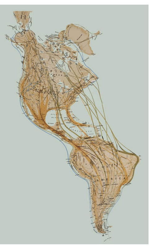
Migrations routes of neotropical migrants. Map: National Geographic Society

Cuba's exceptional biological value can be measured by its high number of endemic plants and animals. The creation of Naval Station Guantanamo Bay in 1903 resulted in the preservation of exceptional habitat for many of these species, some of which are endemic to either Guantanamo or Cuba and are declining elsewhere. A rapid ecological assessment conducted by The Nature Conservancy found eight Cuban endemic bird species were abundant on the base, and significant stopover and wintering use by migrants. A follow-up multi-year, year-round study by The Institute for Bird Populations produced models for apparent survival for seven neotropical migrants and six endemics. Nearly 170 bird species have now been recorded on the base, including nine Cuban endemics.