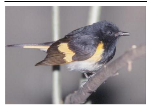
The American Redstart, featured on the Partners in Flight logo, breeds on DoD lands in the U.S. and winters on current and former DoD lands in Puerto Rico and Cuba.

The former Navy range on Vieques Island hosts excellent scrub (thick thorn, forest, and evergreen) and mangrove forest (white, red, black, and button) communities. The avian diversity includes eight endemics among the 40 resident species, as well as a dozen wintering neotropical migrants. This former range is being incorporated into the USFWS National Wildlife Refuge system.