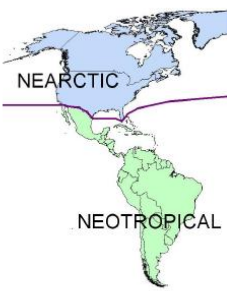
The U.S.-Mexico border is the approximate boundary between the nearctic and neotropical ecological regions.

Habitat destruction and disturbance are the primary threats to West Indian birds. Over the past several centuries, approximately 9 out of 10 avian extinctions have been of endemic island species. Many neotropical migrants share these same habitats and are also adversely affected by their