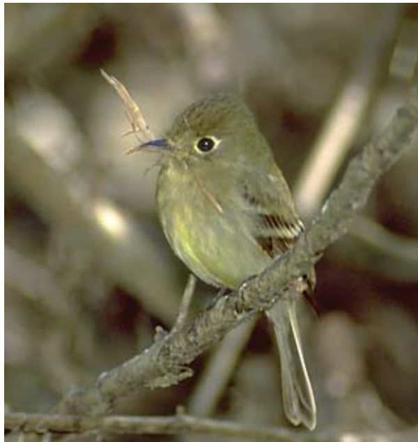
Figure 2. Pacific-slope Flycatcher ( Empidonax difficilis ) collecting nesting material.

In the Pacific Avifaunal Biome , seven survival rate estimates exceeded the mean estimates for the biome. Of the three species of continental importance featured in this biome (Table 1), only the survival rate of the Pacific-slope Flycatcher (0.468) exceeded that of the mean BCR survival rate estimate (0.459). Although the estimate was lower than the Northern Pacific Rainforest (BCR 5) estimate (0.508), California stations mainly contributed to the estimate which was higher than the Coastal Californian (BCR 32) estimate of 0.410.