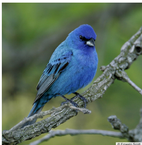
Figure 4. Indigo Bunting ( Passerina cyanea ) prefers weedy/shrubby successional habitats.

As reported in analyses of Legacy-funded MAPS station data (Nott et al. 2003) healthy avian populations can be associated with military lands upon which the objectives of Readiness and Range Sustainment are consistent with providing large military training areas buffered from adjacent private lands. The overall goal is to manage such areas to maximize training opportunities, reduce the risk of wildfire, and protect natural resources.