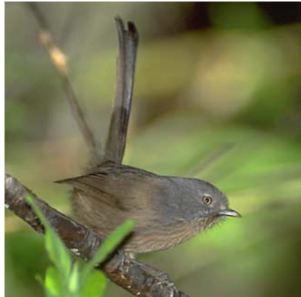
Figure 1. Wrenit ( Chamaea fasciata ) a species of continental importance in the Partners in Flight Pacific Avifaunal Biome.

The Institute for Bird Populations collected and verified data (1992-2006) from the non-Legacy funded network of MAPS stations. These data showed effective demographic monitoring of 34 landbird species at 27 of the 46 stations located on DoD installations. Seven of the 34 species are listed in the Partners in Flight North American Landbird Conservation Plan as Species of Continental Importance (SCI).