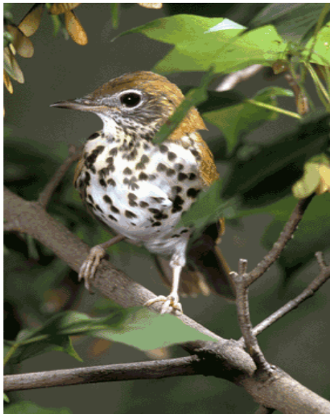
Figure 3. Wood Thrush ( Hylocichla mustelina ), an open forest floor specialist.

In addition, we recommend the continued operation of stations at Fort Lewis, Fern Ridge Lake, Hunter-Liggett, Vandenberg AFB, Camp Roberts, and Fort Sill, because they have high capture rates of many species including Pacific-slope Flycatcher, Wrentit, California Towhee, and Winter Wren.