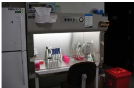
A biological safety cabinet used for cell culture.

Our cell culture laboratory contains all of the features needed for maintaining cell lines and handling biological tissue samples: biological safety cabinets, refrigerators, low temperature freezer, cryogenic storage, incubators, centri-fuge, plate reader, optical microscopes, etc. Several cell lines have been established including fibroblasts, adrenal cells, and vascular smooth muscle cells, among many others.