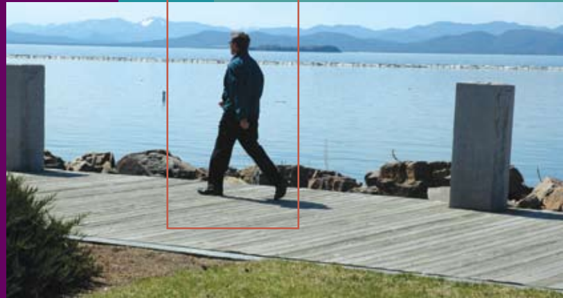
Utilizing VHCB's tools and funding, city officials created the Urban Reserve, which includes conservation easements—allowing limited development and improving access to the waterfront.

“Through strategic advice and grant awards, VHCB has been an active, engaged, and essential partner in helping the Town of Manchester add much needed affordable housing in its downtown while also helping to conserve high priority farmland that remains in active agricultural use today. We are most thankful for VHCB's assistance in helping us to achieve these key community goals. ”