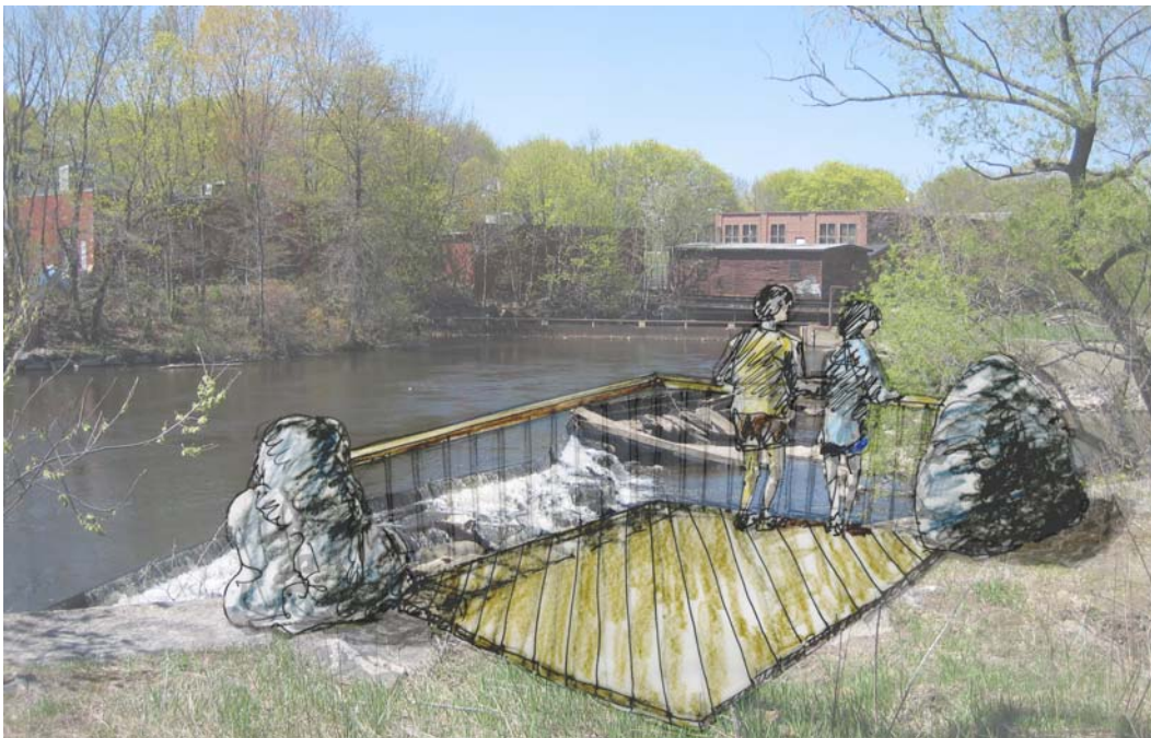
Viewing platform over Massic Falls, looking over the Centennial Island along property formerly known as Guilford RR land, now a key gateway to the Greenway.

The intent of the public art plan is to integrate the multiple layers of information about the Greenway into a document that provides a unique aesthetic flair to the Greenway project. Broad community input was gathered through both indoor and outdoor 'open houses'. Neighborhood residents, city planners, representatives from the local Native American organization, and LP&CT members attended sessions to flag important scenic vistas along the Greenway route and note areas of important ecology or land use history. During final design of the Greenway we hope to integrate many of the artist team's design elements.