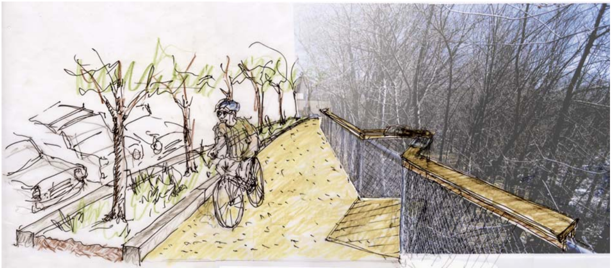
Conceptual drawing of bicyclist riding the Greenway along the edge of what currently known as the Davidson Street lot (Concord River to right). Public art plan image: Harries/Heder Collaborative.