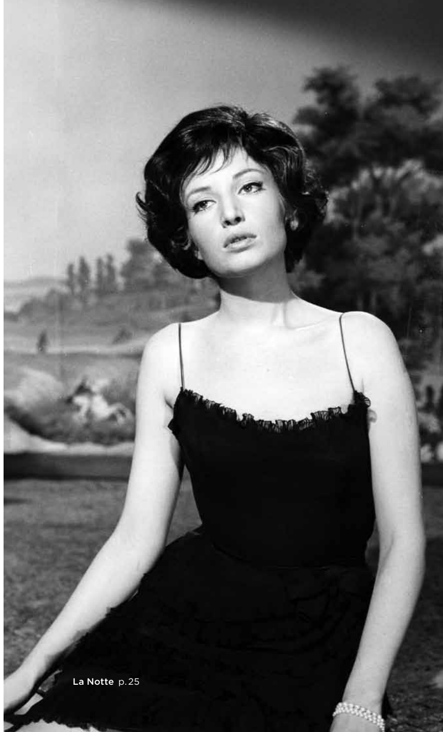
La Notte p.25