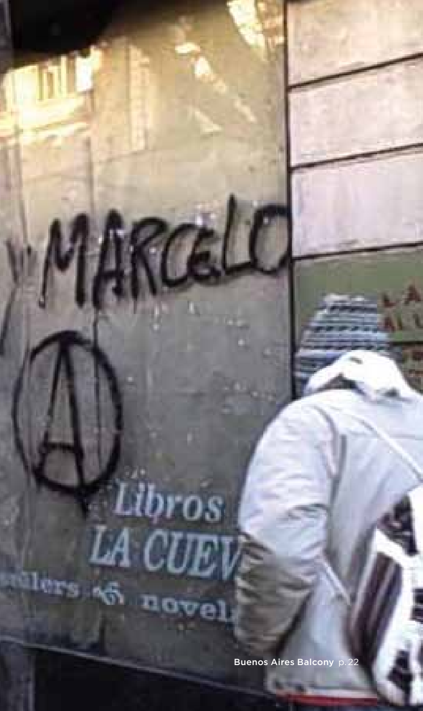
Buenos Aires Balcony p.22