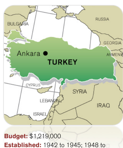
Established: 1942 to 1945; 1948 to present; TV service established in 2005