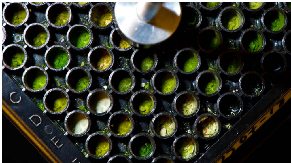
These test tubes in an NREL algae lab hold extractions from several algal strains. NREL is studying carbon metabolism in organisms such as algae to learn how to optimize these organisms to serve as feedstocks for biofuel production.

NREL scientists also wanted the capability to accurately predict the optimal outcomes of metabolic engineering in the laboratory. If hypotheses could be tested in computer simulations, then the scientists could more accurately predict the outcomes of biofuel engineering experiments.