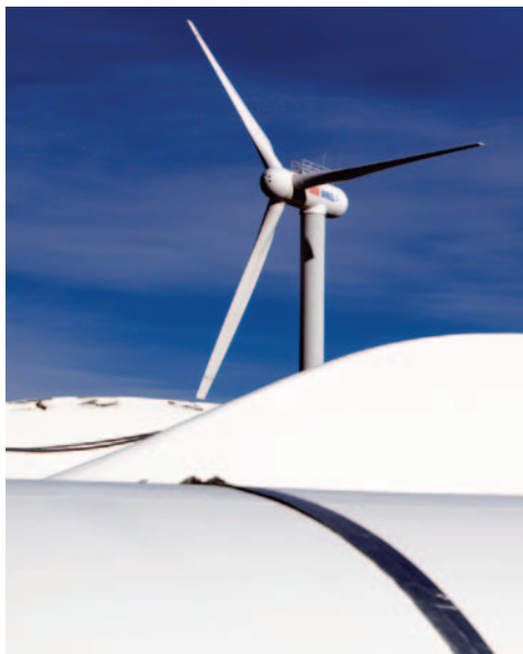
The 2.5-MW Clipper Liberty wind turbine features a new lightweight, enlarged rotor that increases power production, a revolutionary generator design that improves reliability, and reduced gearbox weight and size. PIX 16150

Two decades before launching Clipper, its founder, James Dehlsen, had started Zond, a pioneering U.S. wind power firm. Zond worked closely with NREL, and once it was acquired by another firm in the late 1990s, Dehlsen was free to pursue his latest wind turbine innovations. His new idea was the Distributed Generation Drivetrain (DGD), which Dehlsen patented. The DGD concept offered to lower the cost and weight of the wind turbine nacelle by employing a radical departure from the standard turbine gearboxes. In part, weight savings came from reduced component bulk, accomplished by eliminating much of the heavy copper that would typically be required for windings in the rotor.