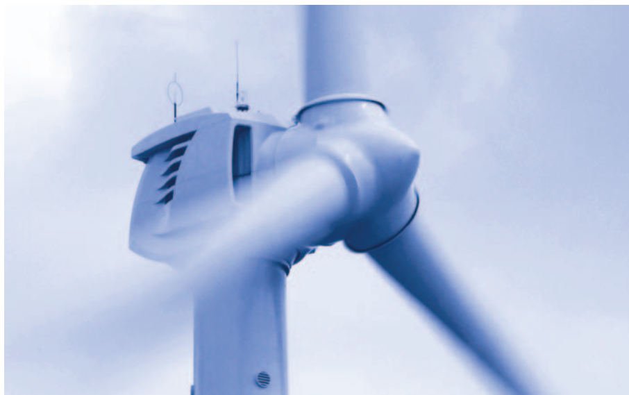
Clipper Windpower of Carpinteria, California, installed a prototype of its new wind turbine near Medicine Bow, Wyoming. The new machine incorporates four permanent-magnet generators, advanced variable-speed controls, and an advanced blade design. PIX 14928