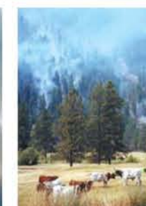
Top right cover photo (billowing smoke) courtesy of Ravalli Republic News.

Office of Air and Radiation EPA-452/F-02-002 www.epa.gov/air May 2003