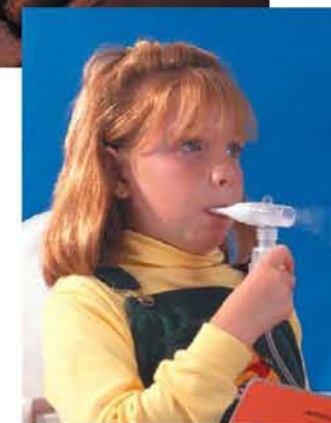
Children with respiratory diseases should be monitored closely during smoke alerts.