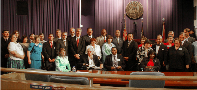
Participants at the signing ceremony included Mayor Ray Nagin, U.S. Attorney Jim Letten, Assistant Attorney General Kim, members of the New Orleans City Council, representatives of the Mayor's Advisory Council for Citizens with Disabilities, and staff of The Advocacy Center and the Department

plans that include provisions for accommodating people with disabilities.