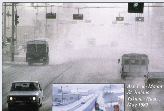
Ash from Mount St. Helens—Yakima, Wash., May 1980