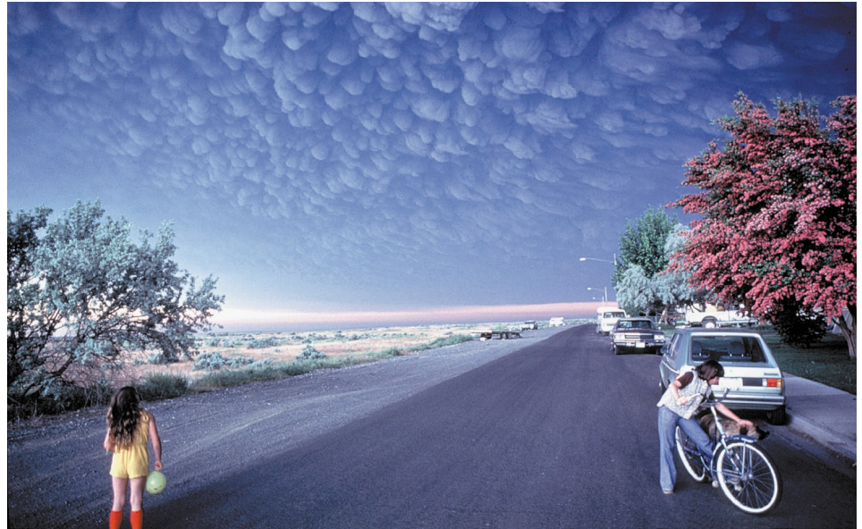
This surreal-looking photo shows an enormous cloud of volcanic ash approaching the small town of Ephrata, Washington, on the morning of May 18, 1980. The ominous cloud was from Mount St. Helens, 145 miles to the west. The volcano had begun to erupt explosively less than 3 hours earlier, catching many communities downwind unprepared for the destructive rain of gritty ash that followed.

V olcanic ash consists of tiny jagged particles of rock and natural glass blasted into the air by a volcano. Ash can threaten the health of people and livestock, pose a hazard to flying jet aircraft, damage electronics and machinery, and interrupt power generation and telecommunications. Wind can carry ash thousands of miles, affecting far greater areas and many more people than other volcano hazards. Even after a series of ash-producing eruptions has ended, wind and human activity can stir up fallen ash for months or years, presenting a long-term health and economic hazard.