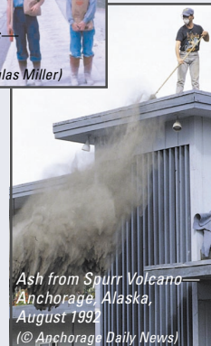
Ash from Spurr Volcano—Anchorage, Alaska, August 1992

Ash fall from the two largest eruptions in the United States in the 20th century (yellow) is dwarfed by ash fall from ancient eruptions. More than $1 billion in losses was caused by Mount St. Helens' 1980 eruption—much of it by ash. Ash falls from future eruptions are certain to be widespread and hazardous. To reduce health risks, people should avoid breathing ash, wear dust masks and goggles, not use contact lenses, and stay indoors when possible.