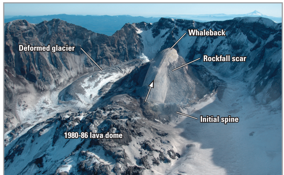
View to southeast of Mount St. Helens' crater. A whaleback-shaped extrusion (part of the new lava dome) emerges from the ground and moves southward (arrow). As it grows southward its edges fracture and crumble, creating a broad apron of blocky debris, over which the extrusion continues to move. Note how the glacier to east is being squeezed and fractured by the growing lava dome. (USGS photo, February 22, 2005)

Deformation associated with intrusion of magma and extrusion of the new lava dome cleaved the crater glacier into two arms. The eastern arm of the glacier, pinched between the new lava dome and the east crater wall, bulged, fractured,