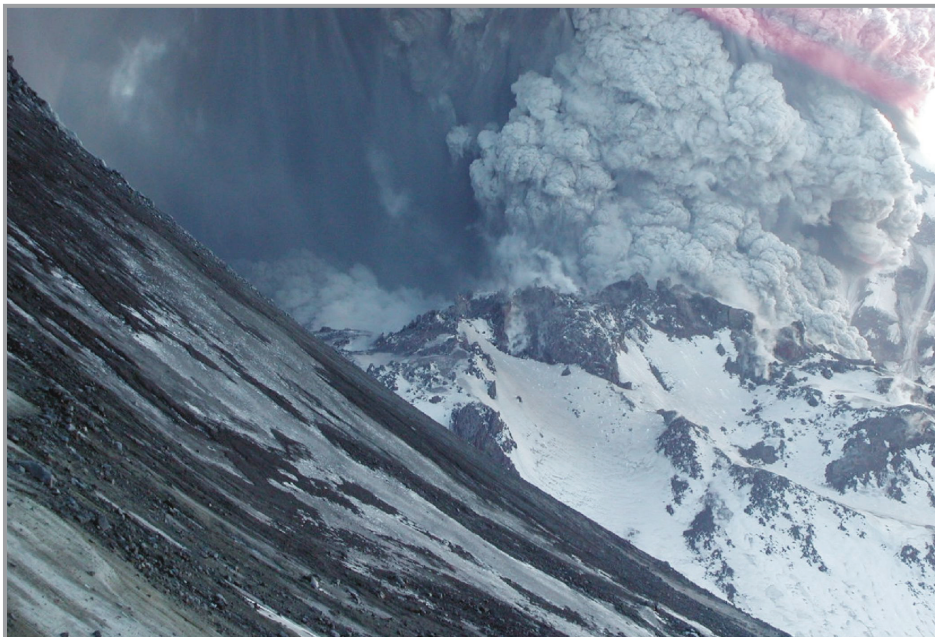
View southwest of Mount St. Helens' crater minutes after onset of the March 8, 2005, explosion. The photograph was taken by a remote camera installed on the "Sugar Bowl" dome at the northeast margin of the crater mouth. The dark cloud to the left consists of a rain of ash and blocks (to about 1 foot diameter) from the eruption plume. The light colored cloud to the right is a plume lofting from a small ash flow moving northward away from the new lava dome. The snow-clad 1980-1986 lava dome is visible in the foreground. The red streaks in the upper right corner are the result of camera imperfections.

COOPERATING ORGANIZATIONS U.S. Department of Agriculture, Forest Service University of Washington