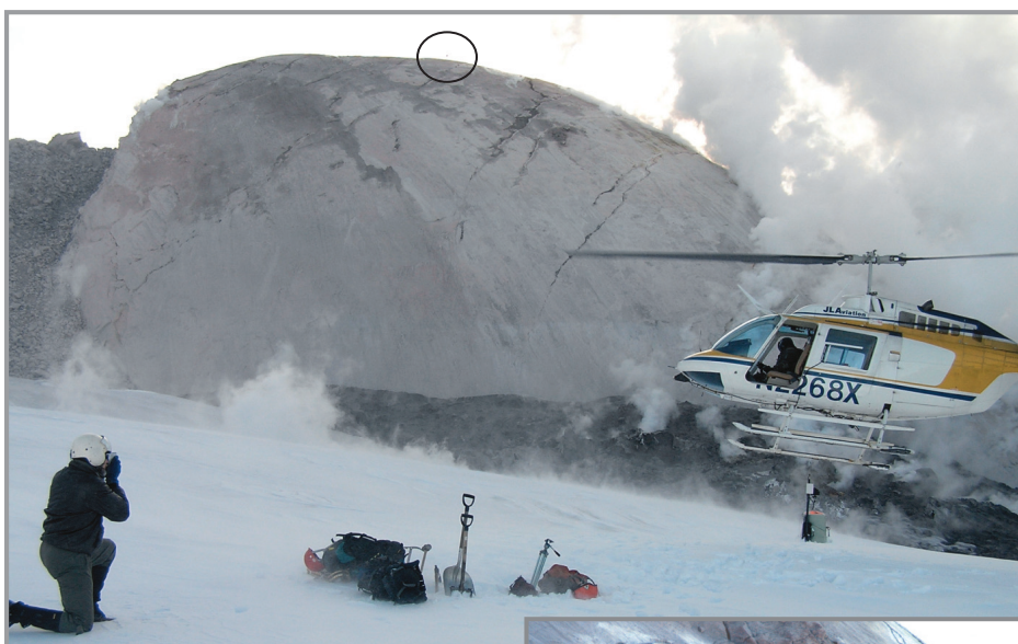
View of north side of the new lava dome from a location immediately south of 1980-1986 lava dome. Circle shows the location of an instrument station on the dome. Inset shows the instrument station, a "tilt-leg spider" package named CDAN, on top of the north-face of the new dome. This station housed a GPS unit and a seismometer until it was destroyed by an explosion on January 16, 2005, 36-hours after placement.

The 2004-2005 dome-growth eruption has been benign so far compared to the May 18, 1980, eruption. Between October 2004 and March 2005, however, it produced two more notable explosions (January 16 and March 8, 2005) that lofted ash plumes (one to nearly 7 miles above sea level, which drifted hundreds of miles downwind) and hurled rock fragments (to about 1 foot diameter) up to a mile across the crater. Continued growth and occasional collapse of the new lava dome may produce additional small explosions and also avalanches of hot debris that sweep out from the dome. Both explosions and hot rock avalanches can create ash clouds that drift downwind, which can endanger aircraft and affect people on the ground.