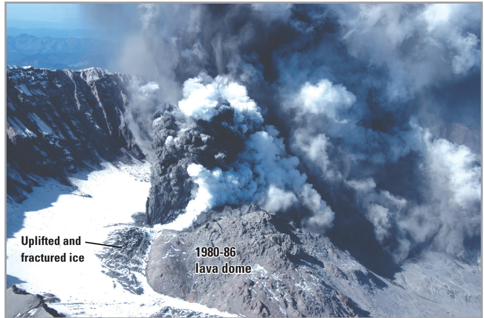
View westward of the steam-and-ash explosion of October 1, 2004. Note the dark-colored ash and white steam emerging simultaneously from a vent through the glacier. Also note the fractured and slightly uplifted glacier ice immediately east of the vent and south of the 1980-1986 lava dome.

After 18 years of relative quiescence, Mount St. Helens volcano recaptured the world's attention when it showed signs of reawakening in September 2004. On September 23 a swarm of small (less than magnitude (M) 0), shallow (less than 1.5 miles below the surface) earthquakes began in and beneath the 1980-1986 lava dome. Initially this swarm resembled previous swarms that had not led to