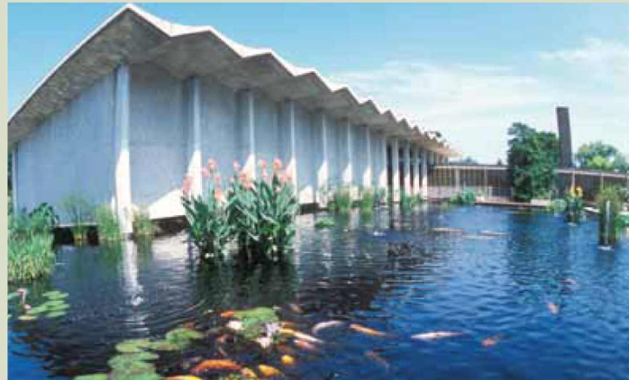
The design of the 1960s Administration Building echoes the upright and branching structure of trees.

In case of emergency, contact Security at (202) 245-4572.