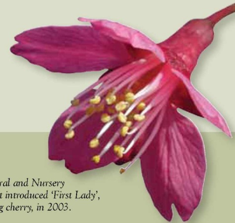
The arboretum's Floral and Nursery Plants Research Unit introduced 'First Lady', a dark pink flowering cherry, in 2003.