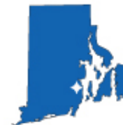
Davisville, Rhode Island