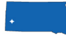
Rapid City, South Dakota