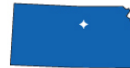
Junction City, Kansas