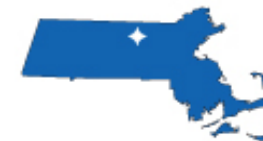
Fort Devens, Massachusetts