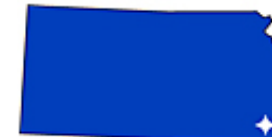
Labette County, Kansas