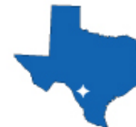
San Antonio, Texas