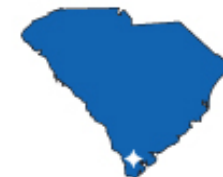
Parris Island, South Carolina