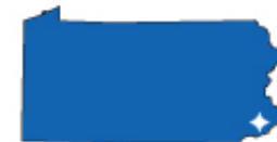
Willow Grove, Pennsylvania