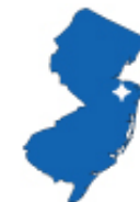
Colts Neck, New Jersey