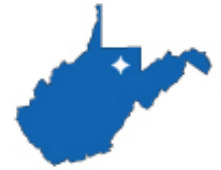
Morgantown, West Virginia