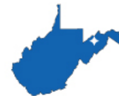
Mineral County, West Virginia