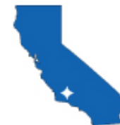
Kern County, California