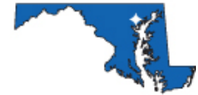
Edgewood and Aberdeen, Maryland