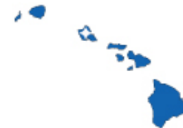
Barbers Point, Hawaii