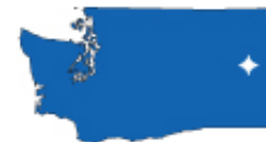
Spokane County, Washington