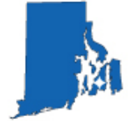
Newport, Rhode Island