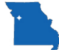
Kansas City, Missouri

Funding to Date: $ 11.1 million Est. CTC (Comp Year): $ 3.1 million(FY 2036) IRP/MMRP Sites Final RIP/RC: FY 2004/None Five-Year Review Status: Underway and planned