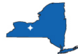
Romulus, New York