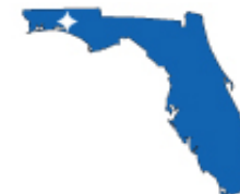
Panama City, Florida