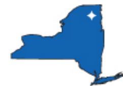
Plattsburgh, New York