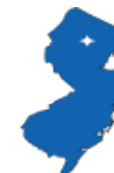
Rockaway Township, New Jersey

Funding to Date: $ 103.9 million Est. CTC (Comp Year): $ 111.1 million(FY 2038) IRP/MMRP Sites Final RIP/RC: FY 2009/FY 2018 Five-Year Review Status: Underway