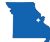
St. Charles County, Missouri