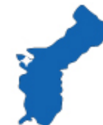
Apra Harbor, Guam