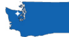
Oak Harbor, Washington