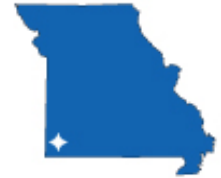
Newton County, Missouri