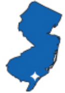
Pleasantville, New Jersey