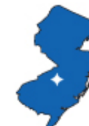
Pemberton Township, New Jersey