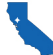
Treasure Island, California