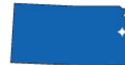
De Soto, Kansas