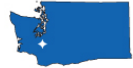
Fort Lewis, Washington

Contaminants: VOCs, PCBs, heavy metals, oils and fuels, coal liquification wastes, PAHs, solvents, battery electrolytes Media Affected: Groundwater and soil Funding to Date: $ 77.7 million Est. CTC (Comp Year): $ 50.9 million(FY 2041) IRP/MMRP Sites Final RIP/RC: FY 2010/FY 2018 Five-Year Review Status: Completed