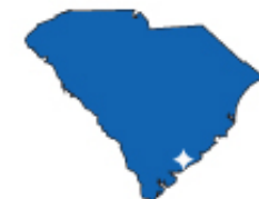
Charleston, South Carolina