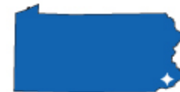
Warminster Township, Pennsylvania