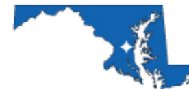
Fort Meade, Maryland