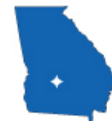
Houston County, Georgia