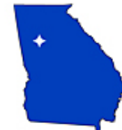
Forest Park, Georgia