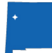
Gallup, New Mexico