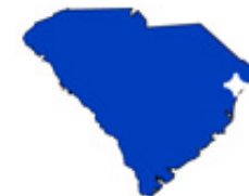
Myrtle Beach, South Carolina