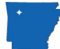
Fort Chaffee, Arkansas