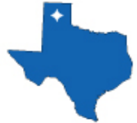
Pantex Village, Texas

Est. CTC (Comp Year): $ 4.0 million (FY 2003) IRP/MMRP Sites Final RIP/RC: FY 2002/FY 2003 Five-Year Review Status: 5-year review not required for this installation