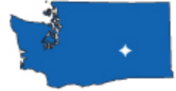
Moses Lake, Washington