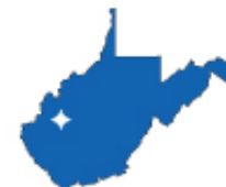
Point Pleasant, West Virginia