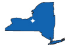
Rome, New York