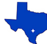
San Antonio, Texas

Contaminants: Aviation and motor fuels, POLs, cleaning solvents, paints, thinners, pesticides, hydraulics fluids, VOCs, SVOCs, TCE, PAHs, PCBs, metals Media Affected: Groundwater, surface water, sediment, soil Funding to Date: $ 7.9 million Est. CTC (Comp Year): $ 0.0 million(FY 2011) IRP/MMRP Sites Final RIP/RC: FY 2002/None Five-Year Review Status: Completed