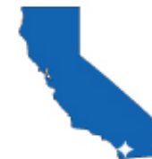
San Diego, California