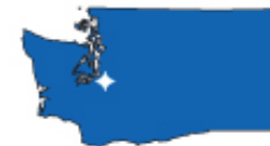
Kitsap County, Washington

Contaminants: Heavy metals, VOCs, POLs, grit, paints, solvents, construction debris, acids, silver nitrate, ordnance compounds, munition items Media Affected: Groundwater, surface water, sediment, soil Funding to Date: $ 178.1 million Est. CTC (Comp Year): $ 82.5 million(FY 2031) IRP/MMRP Sites Final RIP/RC: FY 2014/FY 2013 Five-Year Review Status: Completed and planned