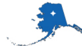
Fairbanks, North Star Borough, Alaska