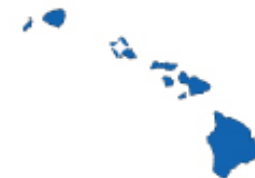
Wahiawa and Lualualei, Hawaii