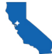
San Francisco, California