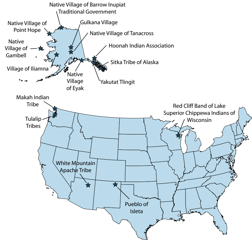
Figure I-2 Cooperative Agreements

I-2). Since its inception, DoD has executed over 116 new or continuing NALEMP CAs to partner with tribal governments to address environmental concerns. CAs are both DoD's and the tribes' preferred method to undertake environmental cleanup because CAs maximize the use of both federal and tribal resources to mitigate impacts.