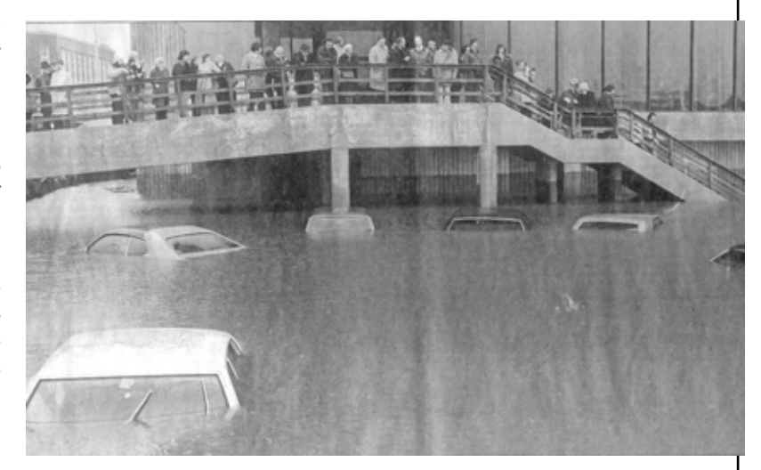
Flooding in downtown Bangor, ME, 1976

The storm surge was amplified as it pushed up the Penobscot River, nearly 20 miles from the Penobscot Narrows, toward downtown Bangor.