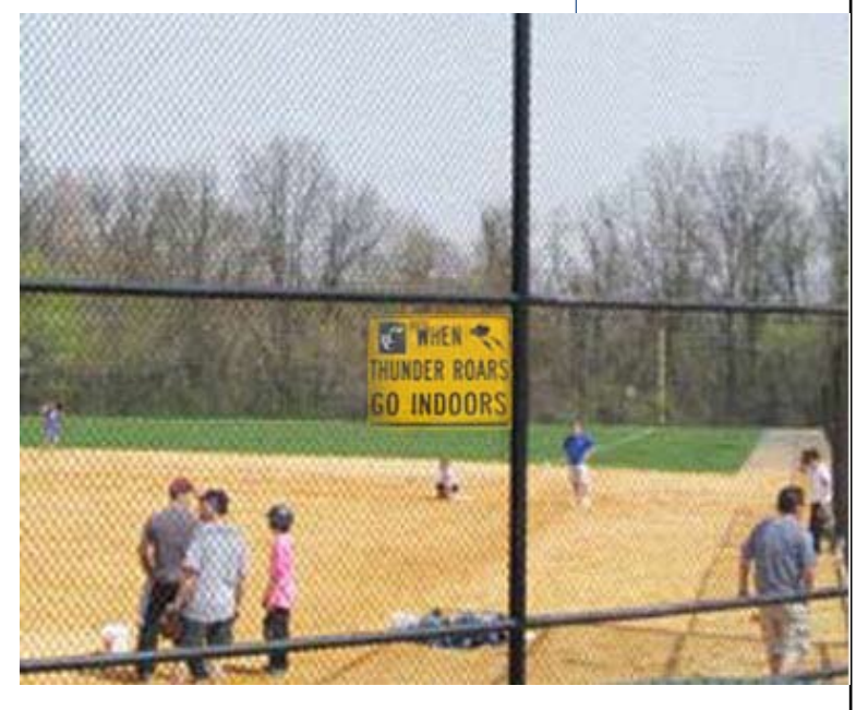
Park, playgrounds, ball fields, pools and other outdoor recreation locales in Howard County, MD, now sport these bright yellow signs reminding people to go indoors as soon as they hear thunder.

On average, each year in the United States, lightning kills 58 people and injures about 400 others. Many of those injured suffer from a variety of long-term, debilitating symptoms and permanent neurological disabilities. A large percentage of victims reportedly were seeking shelter when hit but waited too long to get to safety.