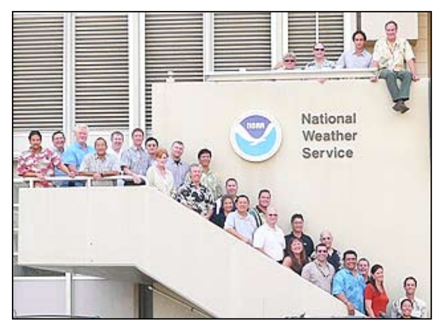
Attendees at the 3-day Hurricane Course exchange ideas and make contacts.

For most attendees, the most important feature of the course is the chance to build face-to-face relationships between NWS hurricane specialists and the EM community. Many EMs recognized