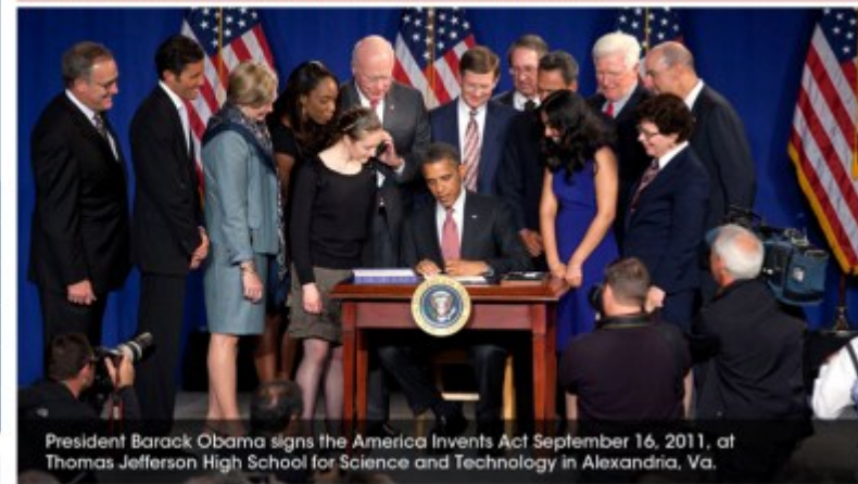
President Barack Obama signs the America Invents Act September 16, 2011, at Thomas Jefferson High School for Science and Technology in Alexandria, Va.