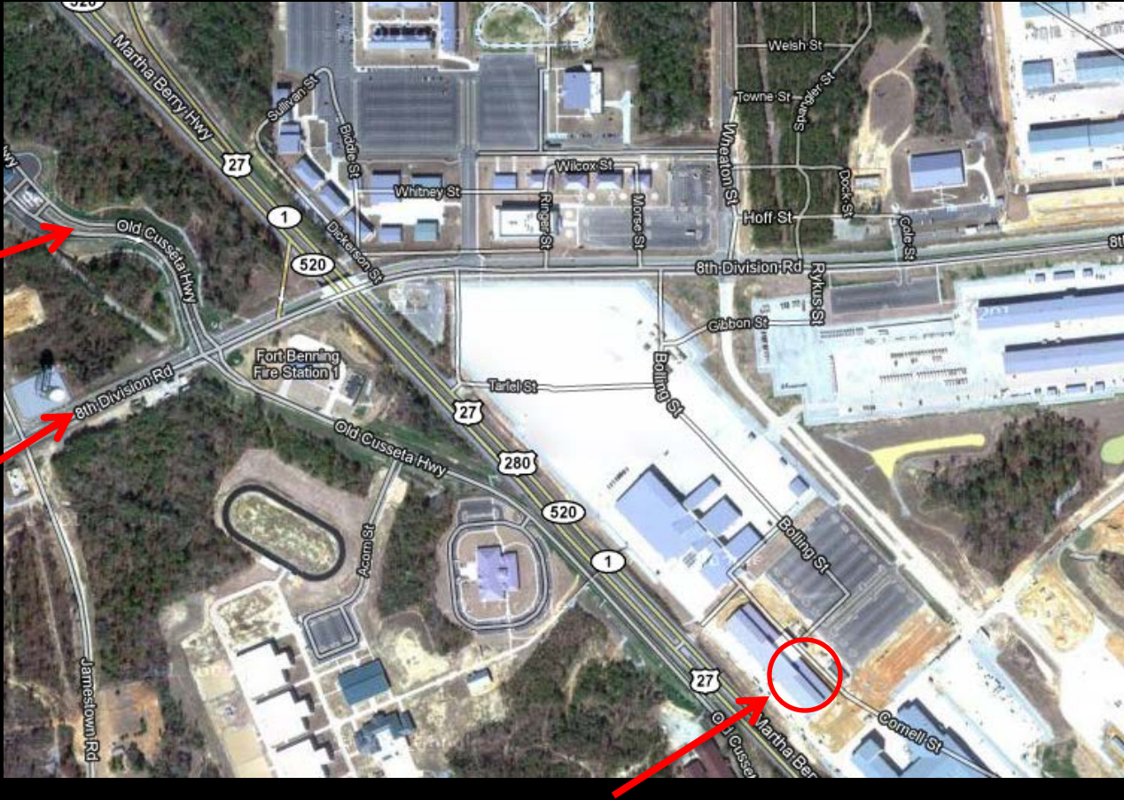
Master Gunner School: Bldg 5210, Harmony Church (Click the Circle for Google Maps Link)