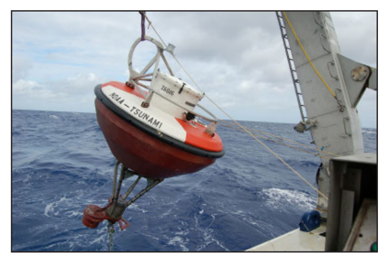
A Dart II buoy being lowered into the Pacific Ocean.

The two centers are responsible for issuing tsunami advisories, watches, warnings and information messages to emergency management officials and the public. In addition, the Pacific Tsunami Warning Center serves as the operational center for the Tsunami Warning System of the Pacific , which is comprised of 26 member nations of the Pacific Rim. In this international role, this center issues tsunami warnings for