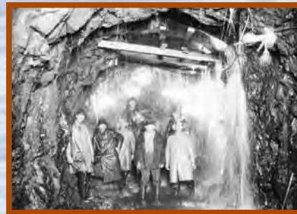
Difficult working conditions

Reclamation investigated various reservoir sites and irrigation plans while local farmers worked toward irrigating their land. Many pumped water directly from the river. The high cost of pumping led water users to enter into repayment contracts with Reclamation for the cost of constructing the Owyhee Project. President Coolidge approved the project in 1926 for the sole purpose of irrigation.