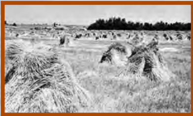
An early wheat harvest

The 1862 discovery of gold brought miners and pioneers to the arid desert lands of southeastern Oregon and southwestern Idaho. Farms developed in nearby river valleys where water was easily obtained. By the early 1900s, private diversions from the Owyhee and Snake Rivers irrigated about 6,000 acres used to produce fruit and alfalfa and raise livestock. As more people came to the region, farmers developed land farther from the rivers.