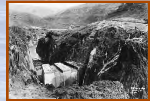
Owyhee Dam on the rise

Workers started building the project's only storage dam and the canal system in 1928. Owyhee Dam, standing 417 feet above the riverbed, ranked as the world's highest dam when it was completed in 1932. Engineers used the dam as a proving ground for the design and upcoming construction of the huge Hoover Dam (726 feet high) which, because of its size, would require new construction methods.