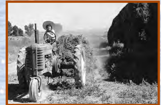
Farming – a family affair

Project facilities delivered the first irrigation water in 1935. The canal system reached the entire project area by 1939, bringing more lands into production.