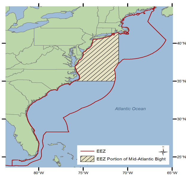
Figure 1: Atlantic Portion of EEZ: State/Federal water boundary seaward to 200 nautical miles.

Pelagic longline sets must not exceed 20 nautical miles (nm) (37.04 km) in mainline length in the EEZ portion of the MAB (Figure 1), including the Cape Hatteras Special Research Area (see Figure 2).