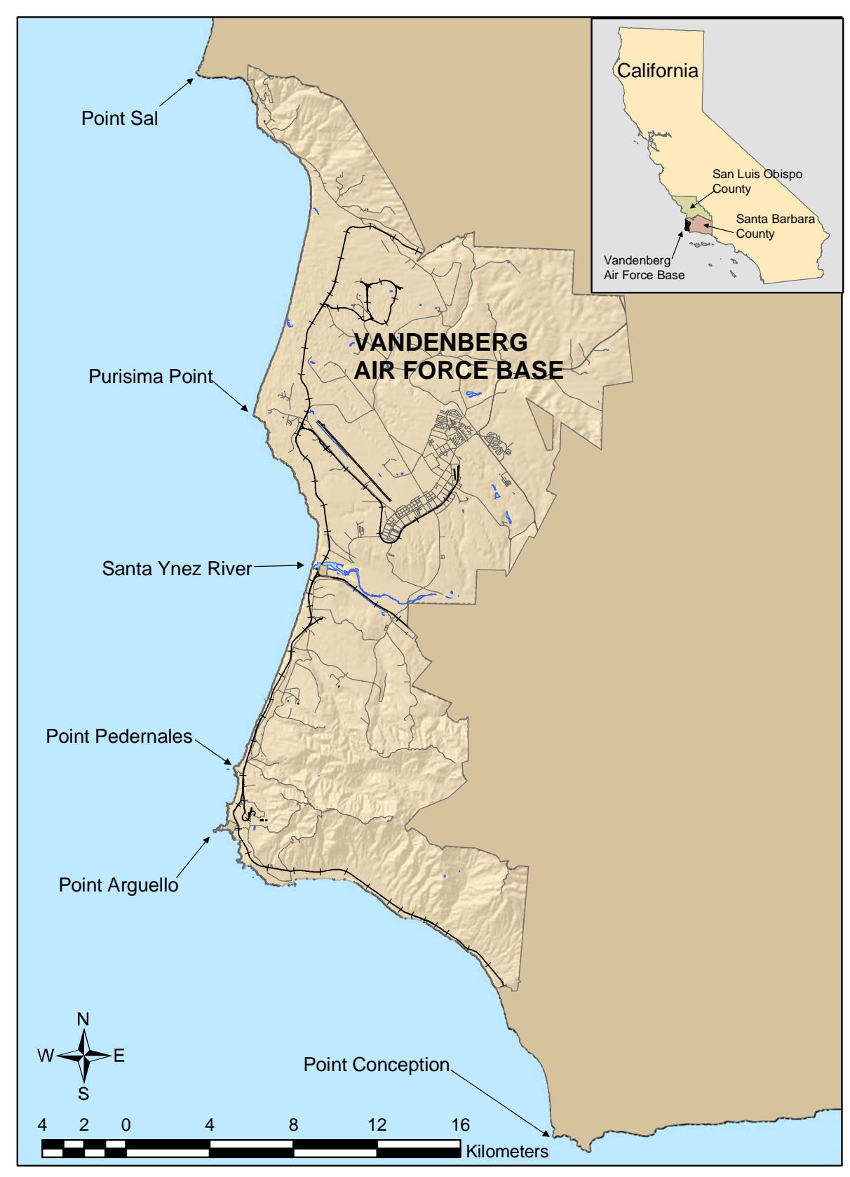
Figure 1. Map of VAFB and coastal landmarks and its location within California (inset).