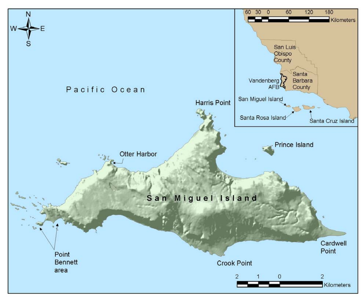
Figure 4. SMI and its major haul-out sites, and the NCI in relation to VAFB (inset).

Table 4. Delta IV vehicle configurations and estimated maximum overpressures