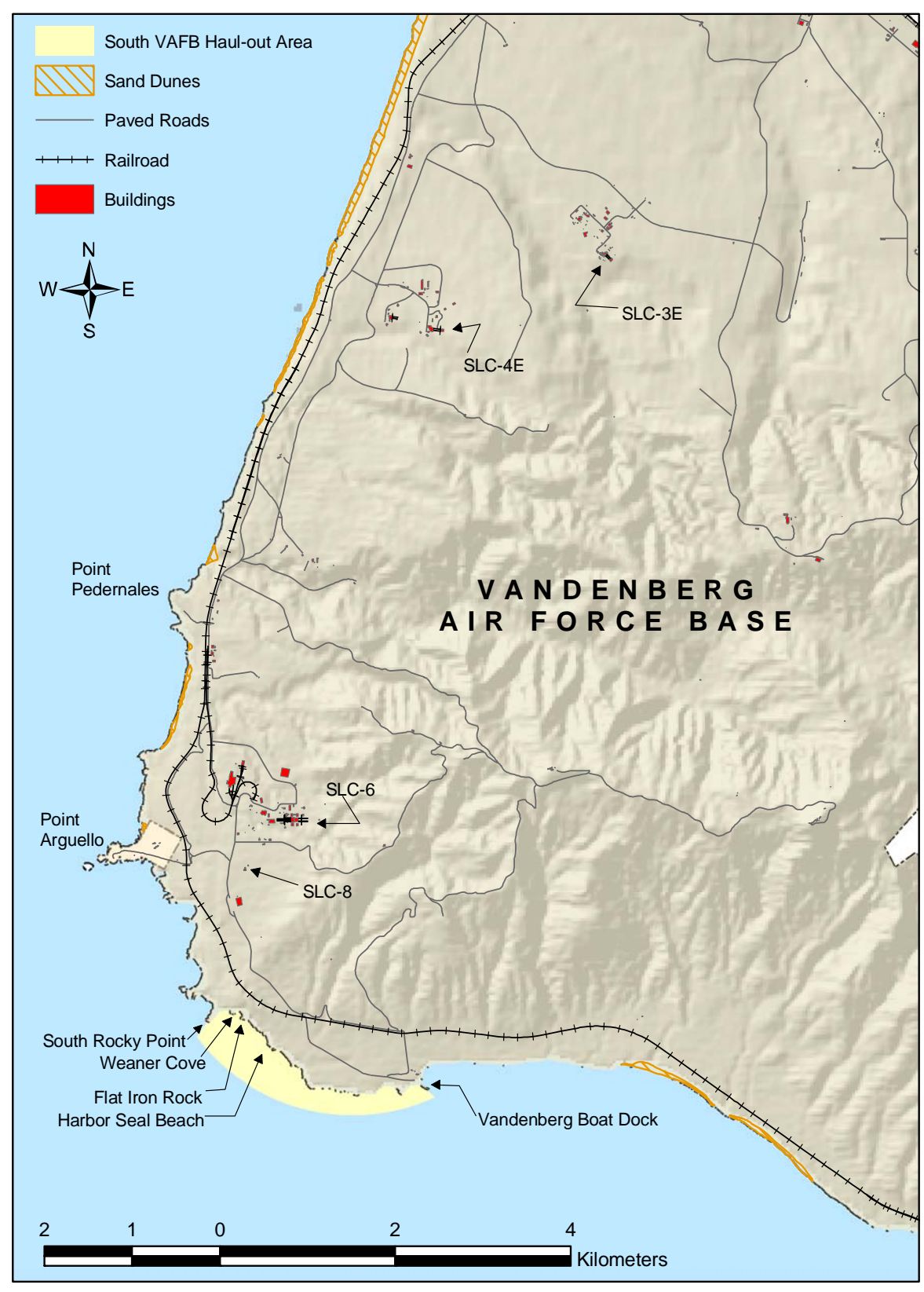
Figure 2. Map of main harbor seal haul-out area and active SLCs on south VAFB.