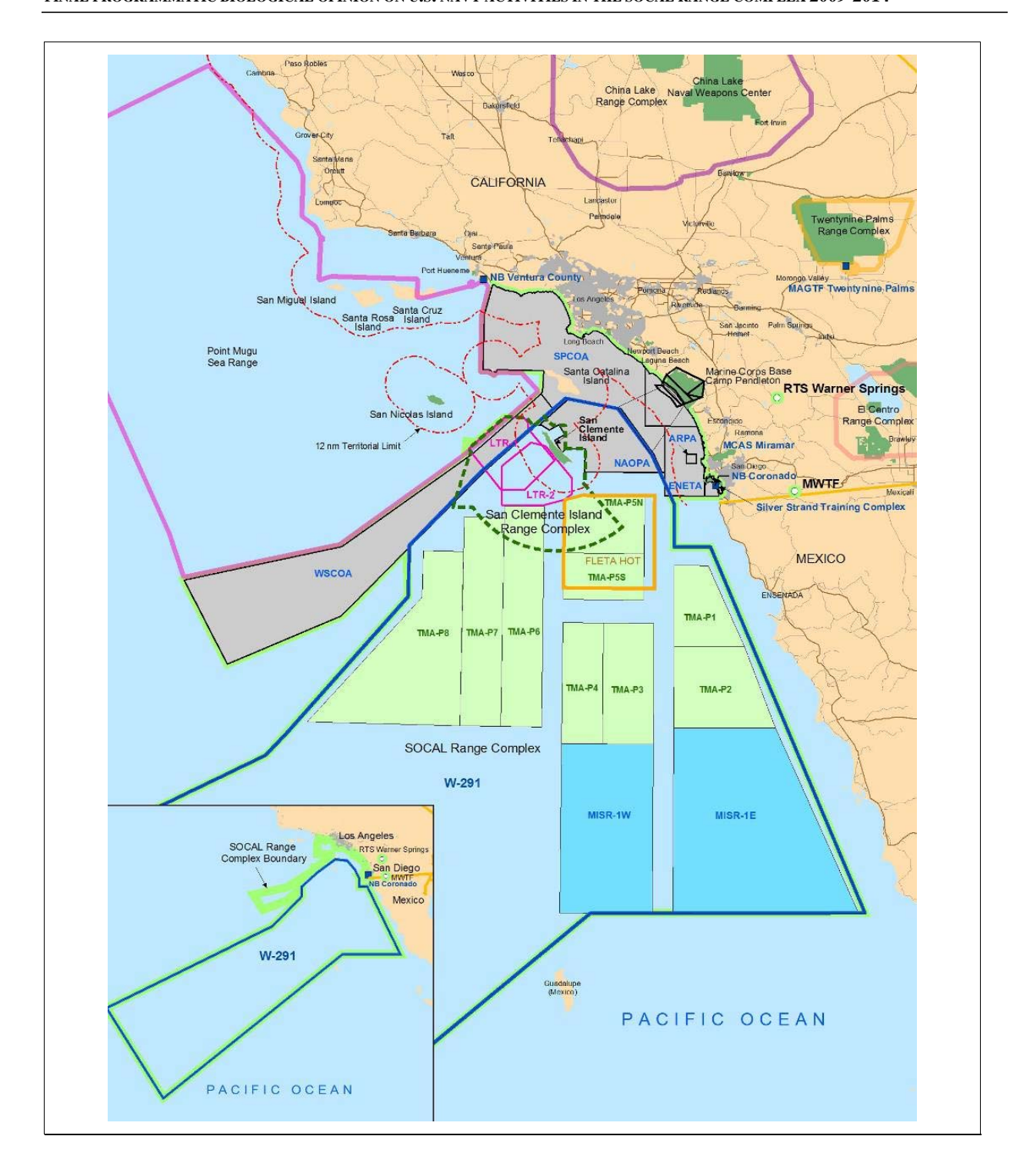
Figure 3. The Southern California Operating Area