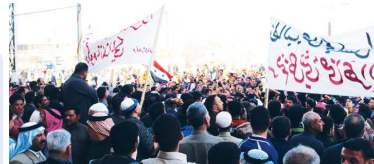
Residents of Falluja protest corruption and the lack of public services, February 2011.

Joint Anti-Corruption Council (JACC) The JACC comprises representatives from the Council of Ministers (CoM), COI, IGS, BSA, and HJC. Its primary task is coordinating the implementation of the NACS.