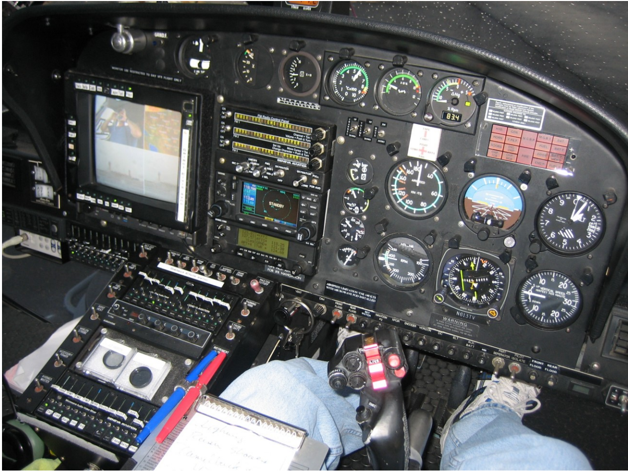
Figure 1. AS350B2 ENG Helicopter Instrument Panel.

threats, provided a 20- to 30-second warning of aircraft that were on a collision path, and plotted the eight most threatening aircraft locations on the display.