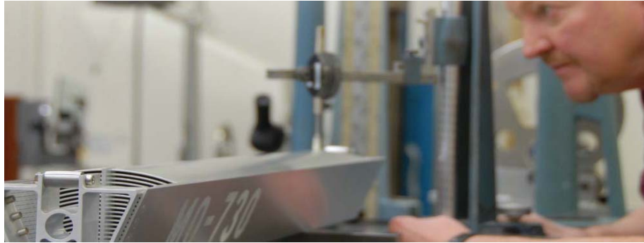
Figure 3. Fuel cycle facility personnel with a research test reactor fuel assembly.

NRC is currently conducting onsite MC&A inspections using one fully qualified inspector for 32 hours, supplemented by inspectors-in-training. NRC Core Inspection Requirements estimate that 64 hours are required to complete an MC&A inspection at a Category I fuel cycle facility.