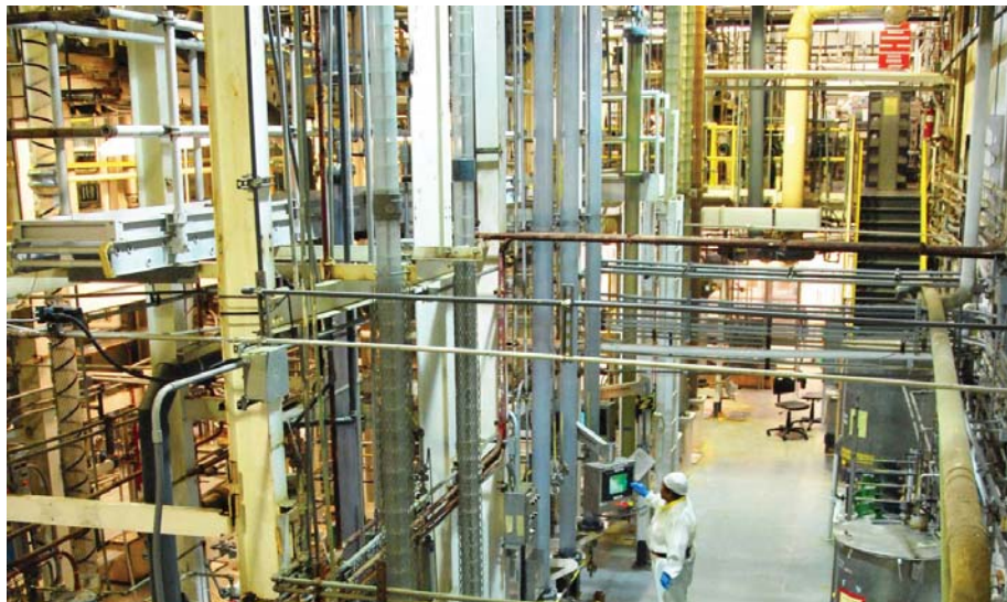
Figure 1. Fuel cycle facility processing uranium.

NRC requires up-to-date, detailed procedures that provide guidance on setting inspection priorities. Currently, inspectors must choose their MC&A inspection activities without the benefit of prioritized procedures containing detailed sampling instruction. Management stated that they had not been made aware of any need for procedure revisions by the inspectors. The result is that there is no assurance that MC&A inspections are conducted in a consistent, thorough manner.