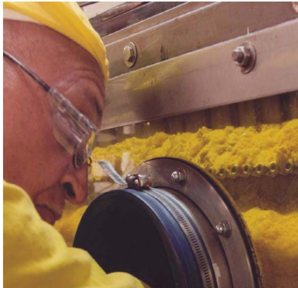
Figure 4. Fuel cycle facility employee processing uranium.

NRC branch chiefs play an important role in overseeing inspection activities and should have a level of MC&A understanding that enables them to ensure effective performance of their branch. However, the branch chief responsible for approving MC&A fuel cycle facility inspection reports lacks specialized classroom training in this area. Specialized MC&A training is not required as a prerequisite to meet the qualifications to become an NMSS MC&A branch chief. However, without specialized classroom or equivalent training, NRC lacks assurance that its branch chief has expertise for thorough and independent assessment of inspectors' work, increasing the risk that inspector errors will go undetected.