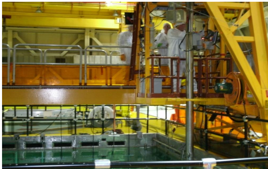
Figure 6. Fuel assembly loading at the Brunswick Nuclear Power Plant

The expected receipt of applications to construct and operate new nuclear power plants, and to dispose of high-level radioactive waste, are two of the major challenges potentially facing the NRC over the next several years. NRC strives to be a stable regulator in an ever changing and dynamic environment. To that end, NRC expects a level of consistency in the performance of ISFSI inspections. NRC's guidance not only defines inspection program requirements, it also serves as a framework intended to achieve consistency in the performance of ISFSI inspections.