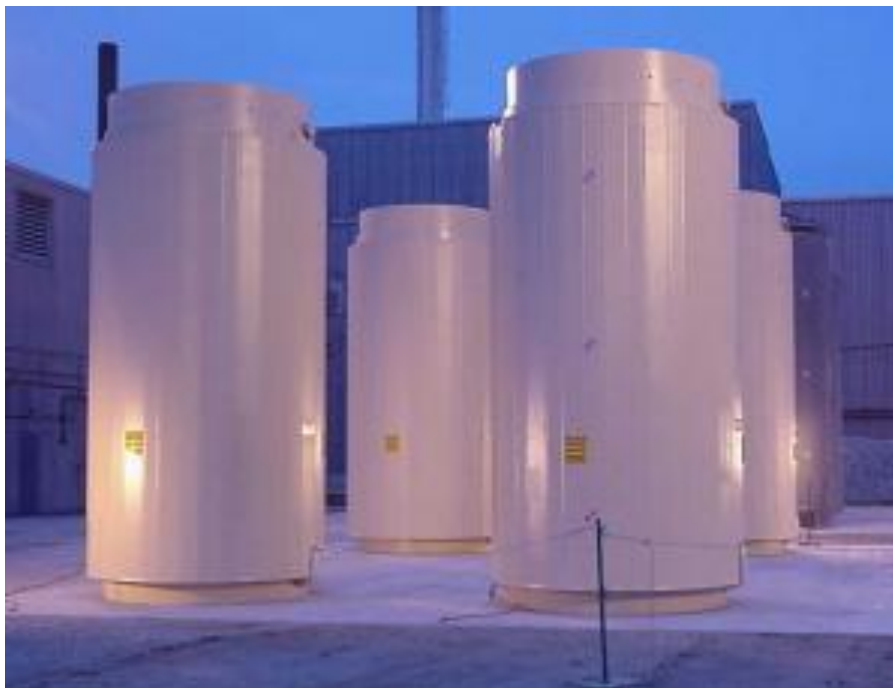
Figure 2. ISFSI at the Dresden Nuclear Power Plant

combination of spent fuel storage pools or dry casks at either onsite or away-from-reactor ISFSIs. Appendix A of this report contains an overview of this decision, known as the Waste Confidence Decision.