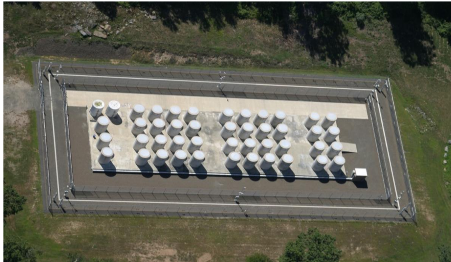
Figure 5. An aerial view of an away-from-reactor ISFSI

Current ISFSI safety inspector training does not provide inspectors with a consistent understanding of NRC's inspection requirements. Specifically, NRC staff do not have a consistent understanding of the agency's requirements relating to ISFSI inspections, the use of enforcement at ISFSIs, and the role of resident inspectors at sites with ISFSIs.