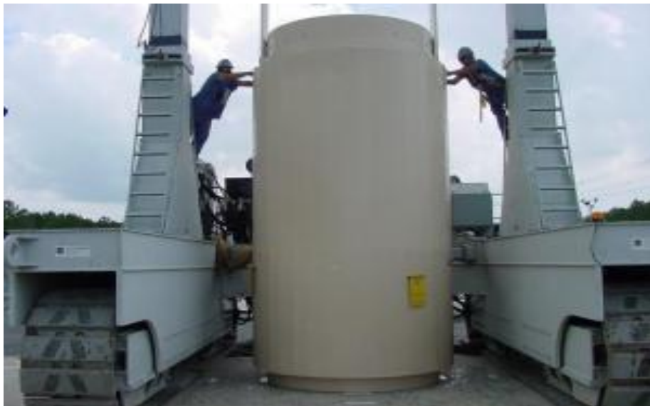
Figure 4. A cask being set on an ISFSI with a Vertical Cask Transporter