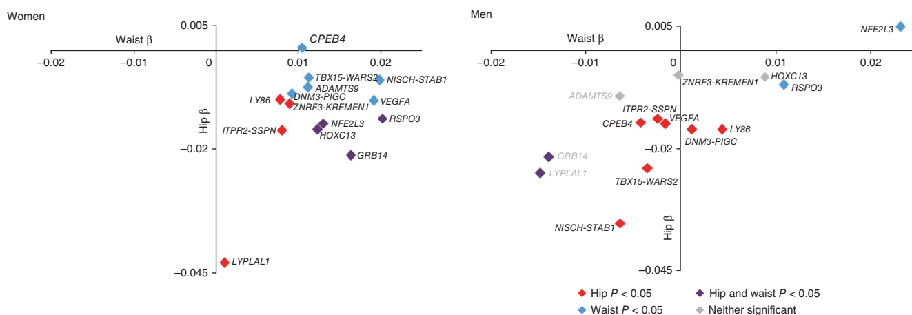
Figure 3 Association of the 14 WHR loci with waist and hip circumference. \beta coefficients for waist circumference (WC, x axis) and hip circumference (HIP, y axis) in women and men derived from the joint discovery and follow-up analysis. P for WC and HIP are represented by color. In men, gray gene labels refer to those SNPs that were not significant in the male-specific WHR analysis. More details can be found in Supplementary Table 3 .

We evaluated the 14 WHR-associated loci for their relationships with related metabolic traits using GWAS data provided by trait-specific