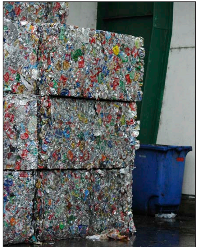
Many different kinds of materials can be recycled

amount of waste each person generates continue to increase. Municipal solid waste (MSW) includes items that are normally thrown in the trash, such as food packaging or scraps, old furniture, tires, or yard clippings. According to a study by the Environmental Protection Agency (EPA), municipal solid waste generation increased from 2.68 to 4.34 pounds per person per day between 1960