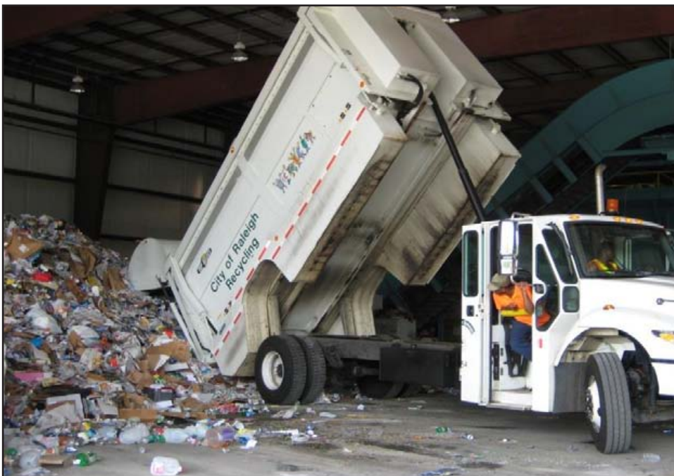
Well-maintained recycling trucks are critical for an MRF's operations

BLS does not have data specific to mechanics, technicians, and machinery maintenance workers at MRFs. However, these workers are included in the occupations industrial mechanics; maintenance workers, machinery; and bus and truck mechanics and diesel engine specialists. Table 1 shows wages for these occupations in the remediation and other waste management services industry group. The