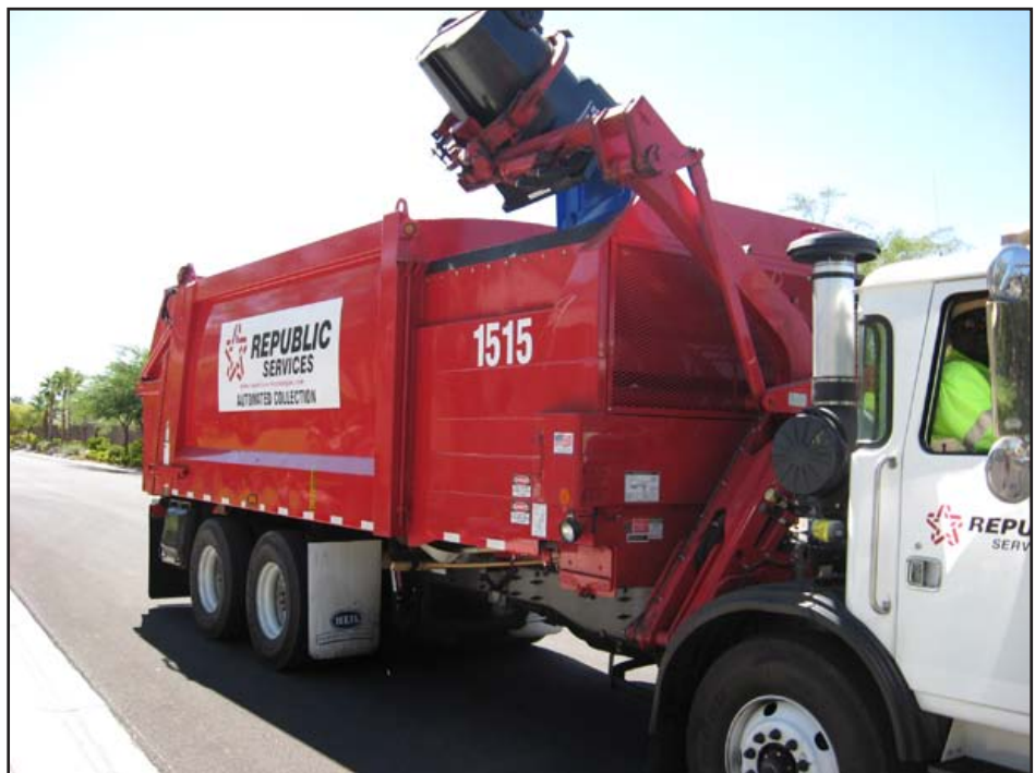
Drivers may use trucks with hydraulic lifting mechanisms

Recycling companies or local governments offering home pickup services employ drivers, also called recyclable material collectors, to pick up and transport recyclables to an MRF.