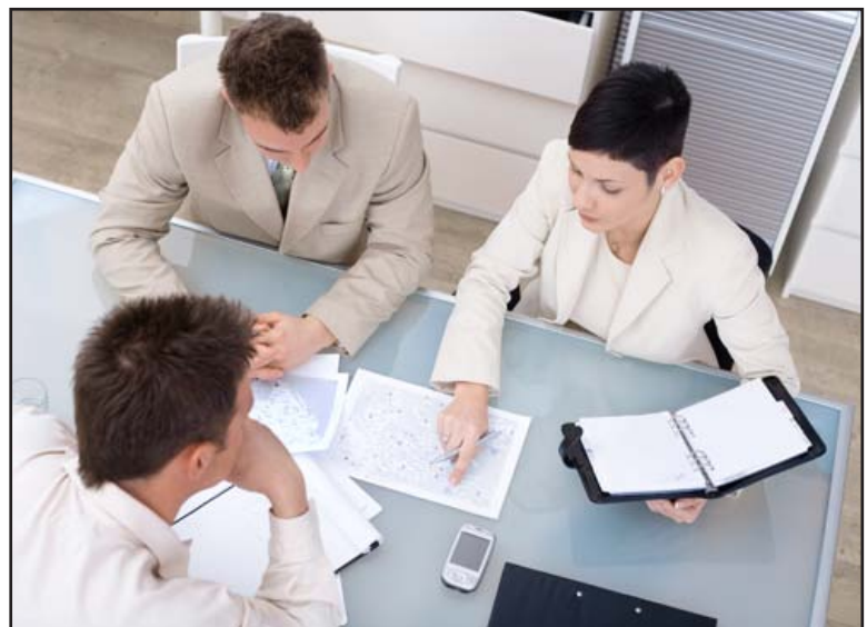
Route managers choose the most efficient schedules for recyclable collection

Using maps and customer data, route managers choose the best schedule and routes for collecting recyclables from customers. They determine the most efficient routes and assign them to drivers. Route managers monitor drivers' routes and might solicit their feedback before making changes. They record statistics, including the length of each route, the time it takes to run each route, number of homes serviced, and the amount of