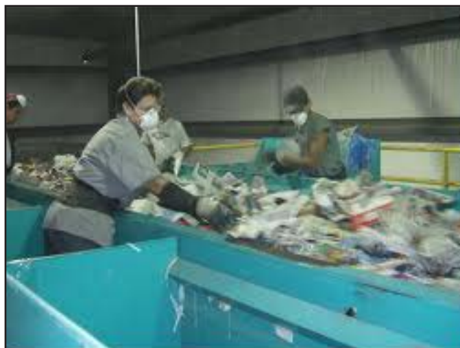
Sorters remove separate unwanted materials from recyclables

There are no specific education requirements for sorters. Many companies conduct drug tests and background checks on prospective employees. Sorters need to be