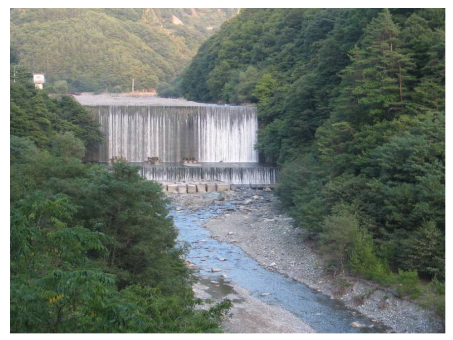
Figure 3. Check dams have been constructed along mountain rivers to store sediment and locally reduce the river gradient.

Figure 2. The sediment bypass tunnel is located at the upstream end of the reservoir and just downstream from the diversion dam.