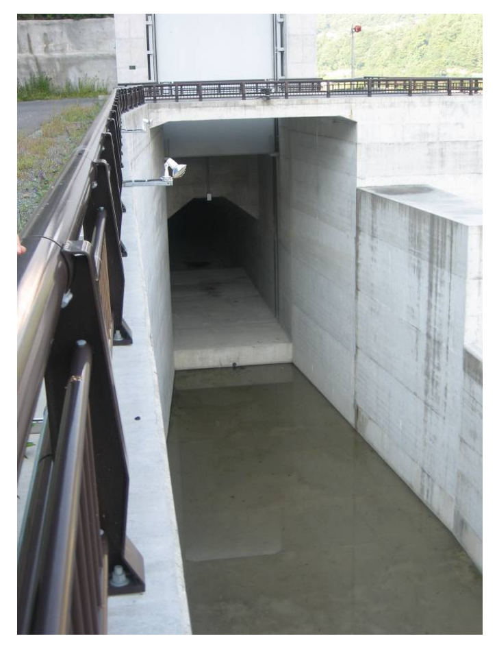
Figure 2. The sediment bypass tunnel is located at the upstream end of the reservoir and just downstream from the diversion dam.