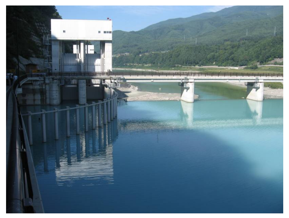
Figure 1. A diversion dam was constructed at the upstream end of the reservoir to discharge sediment laden water into the reservoir bypass tunnel. The diversion gates are on the left side of the photograph.

sediment around reservoirs (Figure 1 and Figure 2). They are also using check dams to reduce sediment loads (Figure 3).