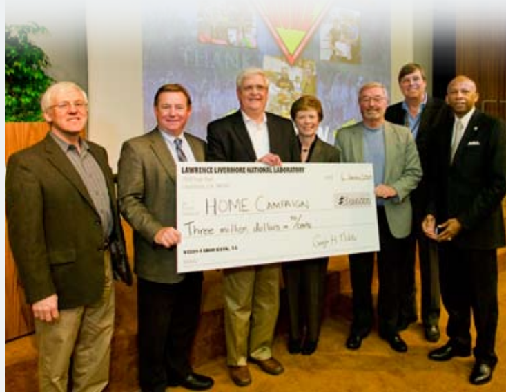
Elected officials gathered to thank Lab employees for their generous donations made through the 2009 HOME Campaign.

LLNL employees, along with Lawrence Livermore National Security, LLC (LLNS), raised more than $3 million — a record breaking amount — to give to surrounding communities. The total contribution, $3,026,151, represents the largest