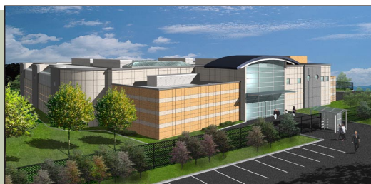
The International Security Research Facility

The ISRF is a state-of-the-art facility that will enable the Laboratory to continue to meet the United States intelligence community’s need for accurate and timely analysis of the threats posed by the