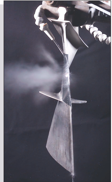
Laser peening induces deep compressive stress, which significantly extends the service lifetime over any conventional treatment.

Laboratory researchers have won 97 R&D 100 Awards since 1978. ♦