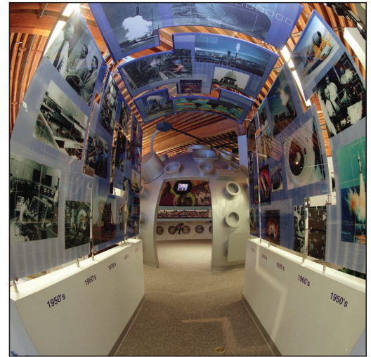
LLNL's Discovery Center

in advance. Special group tours can also be arranged. Tour participants must be at least 18 years of age. For more information about Laboratory tours, go to www.llnl.gov/pao , or call 925-422-4599. ♦