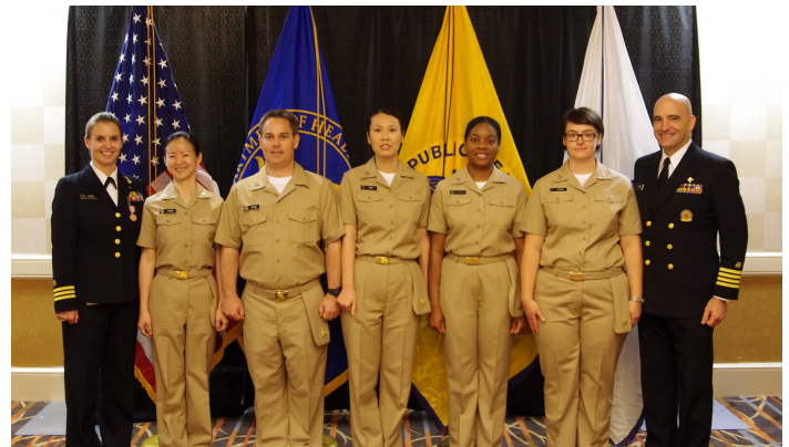
Scientist Officers at the Officer Basic Training Course with the Director of Office of Force Readiness and Deployment

If you have questions about COSTEP, please visit our website at http://www.usphs.gov/student/COSTEP.aspx .