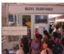
Stand de la Biblioteca en las jornadas de la AMBAC (2003)

La Biblioteca Benjamín Franklin abrió sus oficinas en la ciudad de Monterrey, Nuevo León en 1948