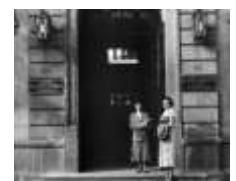
Detalle del acceso principal a la Biblioteca (Reforma, 1942)

"La Biblioteca Benjamín Franklin abrió un tercer establecimiento en la República Mexicana en la ciudad de Puebla en 1951 "