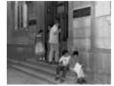
Usuarios en la entrada principal de la Biblioteca (Reforma, 1942)

"La Biblioteca Benjamín Franklin abrió un tercer establecimiento en la República Mexicana en la ciudad de Puebla en 1951 "