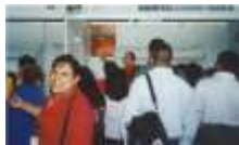
Stand de la Biblioteca en la Feria del Libro en Monterrey (2003)

La Biblioteca Benjamín Franklin abrió sus oficinas en la ciudad de Monterrey, Nuevo León en 1948