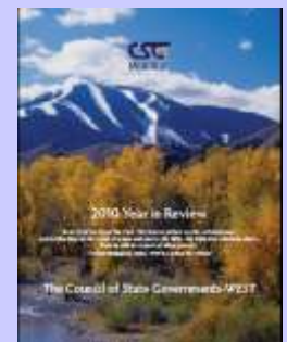
Council of State Government West 2010 Year in Review

http://www.csgwest.org/images/Publications/csg2010yir.pdf