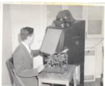
Lector de material microfilmado. BBF. Reforma 34 (1942)