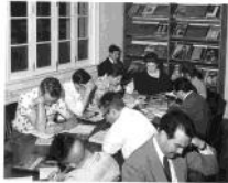
Aspecto de la sala de lectura de la BBF. Reforma 34 (1942)

http://www.ijhssnet.com/journals/Vol_2_No_16_Special_Issue_August_2012/9.pdf