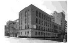
Edificio de la BBF en la calle de Londres 16

A pesar del sismo de 1985 ocurrido en la Ciudad de México, la Biblioteca Benjamín Franklin continuó ofreciendo sus servicios.