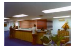
Aspecto del interior del edificio de la BBF en la calle de Londres 16

A pesar del sismo de 1985 ocurrido en la Ciudad de México, la Biblioteca Benjamín Franklin continuó ofreciendo sus servicios.