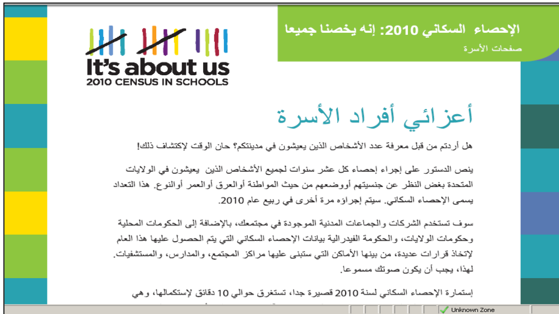
Figure 2: In-Language Material on Website

Under the original plan, Scholastic, Inc. developed the Family Take Home pages in English and Spanish only. When additional funding became available, the Census Bureau chose to have the Family Take Home pages translated into 25 additional languages in order to reach linguistically isolated parents. The Family Take Home pages were the only 2010 CIS product that was translated into the 25 additional languages that were used by the rest of the ICP as part of a decision made by Census Bureau management. Due to lack of funding, the classroom materials were only available in Spanish for Puerto Rico and English. There was nothing translated into stateside Spanish. A letter to the principal in the English/Spanish Family Take Home package announced the online availability of the materials in other languages. Principals or teachers could then go online, download the Family Take Home pages in the languages needed for their students, and print copies. The materials were available online in January 2010.