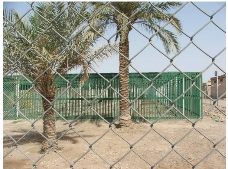
Site Photo 3. Agricultural use of land