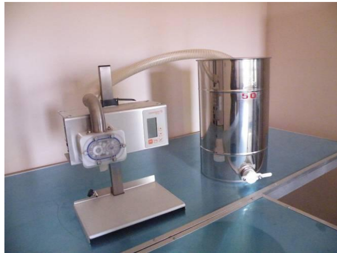
Site Photo 14. Filling machine