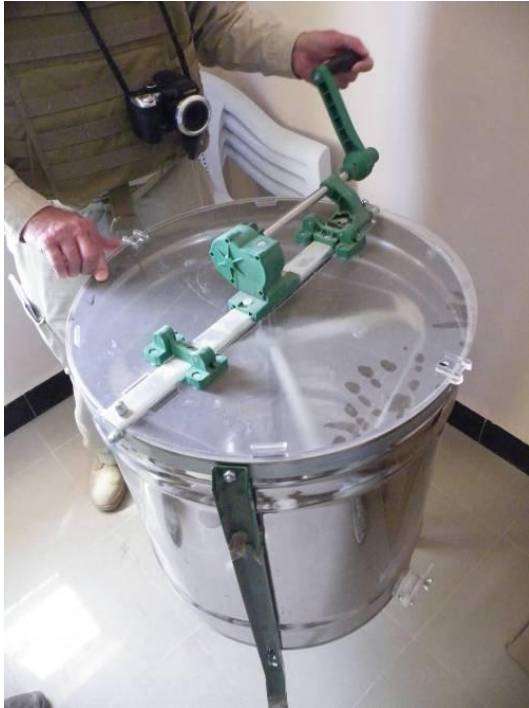
Site Photo 12. Extractor

SIGIR was able to verify that the equipment required by the contract was present. Specifically, SIGIR observed the extractors 5 (Site Photo 12), stainless steel decanters 6 , transfer pump 7 (Site Photo 13), filling machine 8 (Site Photo 14), and a refrigerator to store the honey.