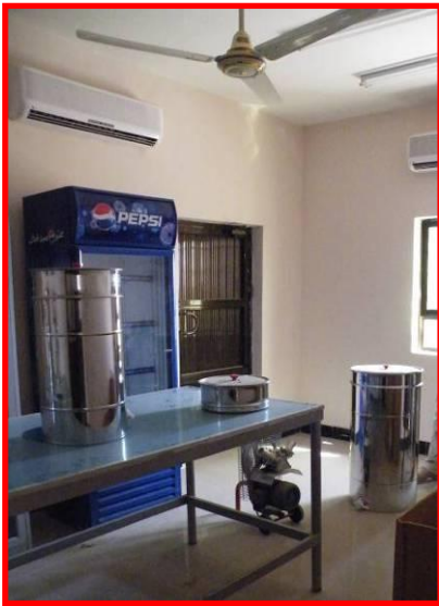
Site Photo 7. Store