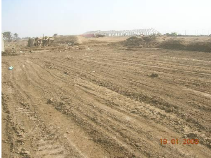
Site Photo 1. Initial excavation of site