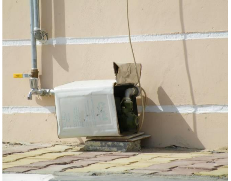
Site Photo 6. Water transfer pump

The septic tank for the facility was located adjacent to the water supply pump. At the time of the site assessment, the tank appeared to be functioning correctly. SIGIR noted there were no odors or vapors coming from the tank and no overflow was observed.