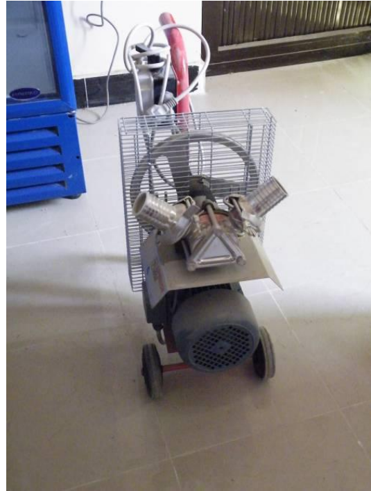
Site Photo 13. Transfer pump