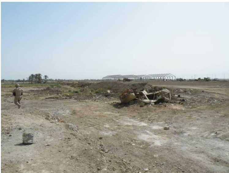
Site Photo 2. Surrounding vacant land

General topography of the area was flat with vacant or agricultural land extending for a significant distance from the site (Site Photo 2). Adjacent to the project was land currently used for agricultural research by the Ministry of Agriculture (Site Photo 3). A primary highway extended along the front of the project site; however, the facility was set back approximately 300 meters from the primary highway.