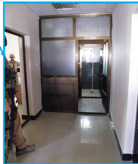
Site Photo 11. Foyer