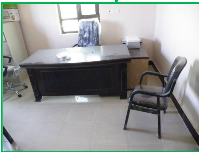
Site Photo 10. Office