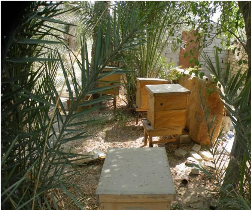
Site Photo 15. Bee hives

Due to the current drought conditions in Iraq, there is not enough vegetation to sustain a high concentration of bee colonies. In order to maintain honey production, the beekeepers are providing the bee colonies with sweetened water (Site Photo 16).