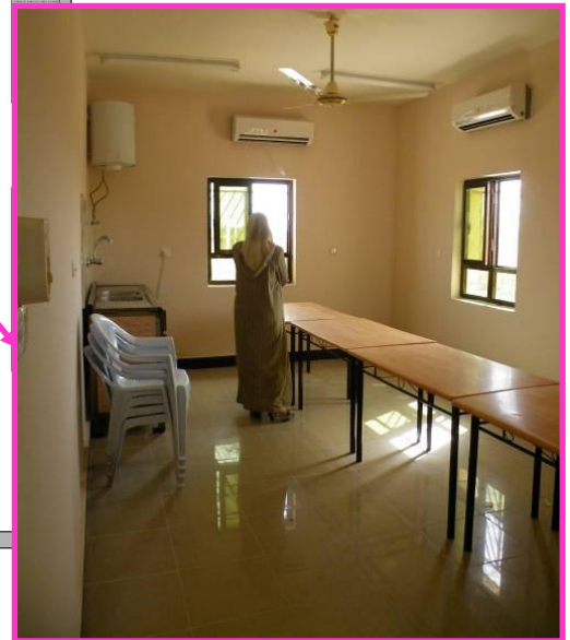
Site Photo 9. Work room