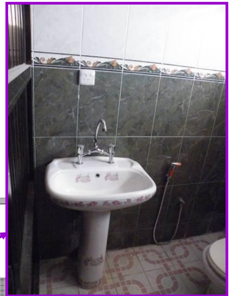
Site Photo 8. Restroom