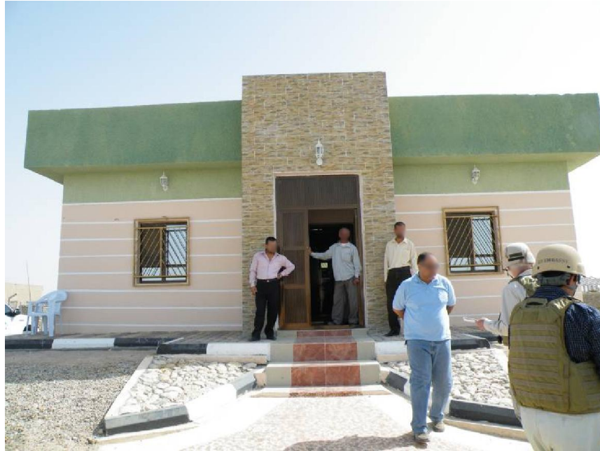
Site Photo 4. Building front exterior

Downspouts were constructed along the exterior walls to drain runoff from the roof. The downspouts were in good condition. The downspouts discharge directly onto the perimeter sidewalk adjacent to the building. With the discharge directly onto the sidewalk, the facility will require long-term maintenance.