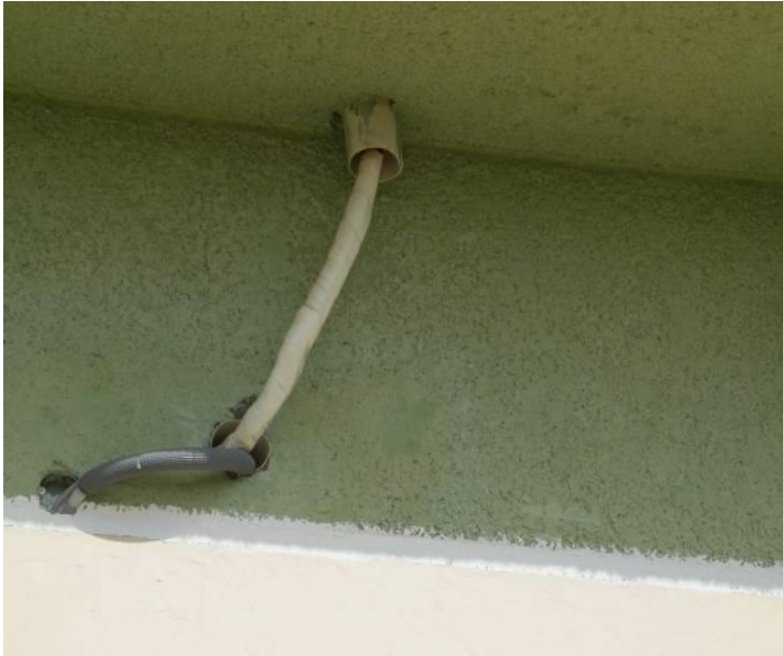
Site Photo 5. Coolant line penetrating roof and wall