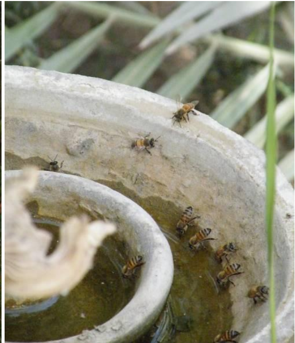
Site Photo 16. Sweetened water