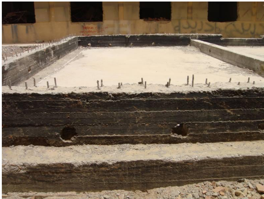
Site Photo 5. Latrine foundation with penetrations for sanitary sewer piping

The perimeter stub walls were constructed on top of the footers, and the penetrations for the latrine plumbing were installed through the walls. Reinforcing steel was present through the top of the wall. However, the length of the exposed bars was minimal (Site Photo 5). The length of the reinforcing, shown in Site Photo 5, was less than that required for embedment or splicing into adjacent pours. The defect was noted in the Mosul Area Office quality assurance (QA) documentation, and the Mosul Area Office was addressing the issue.