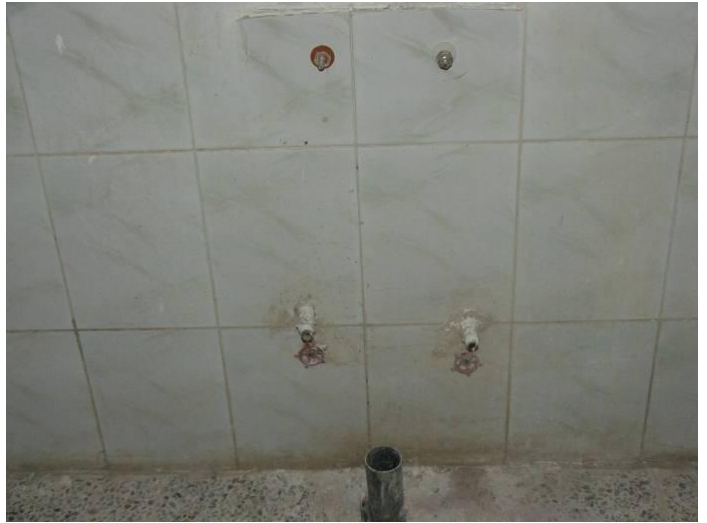
Site Photo 9. Re-plumbing restroom

As part of the renovation, the contractor replaced the tile floor. The floor was level with no apparent cracking or displacement (Site Photo 10). The contractor was in the process of installing new electrical wiring and conduit in the building. In accordance with the SOW, the contractor was surface mounting the conduit (Site Photo 11). The contractor was using junction boxes to join intersecting runs of conduit.