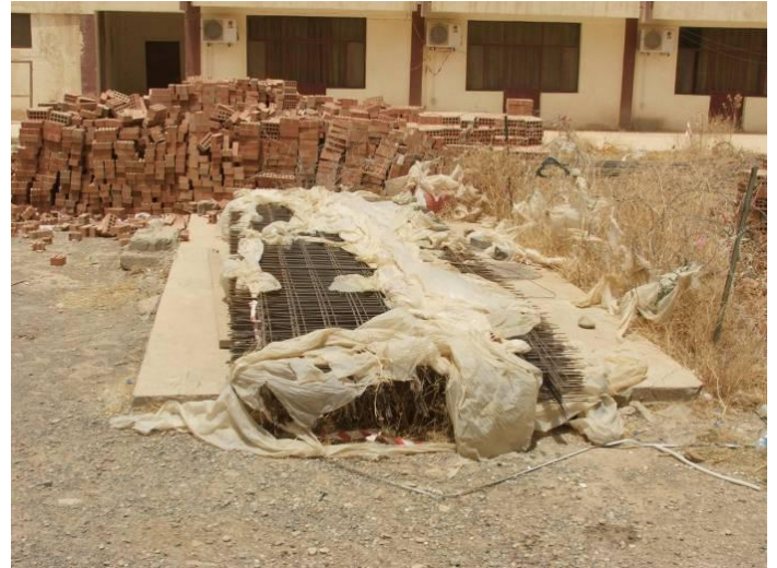
Site Photo 3. Construction rebar