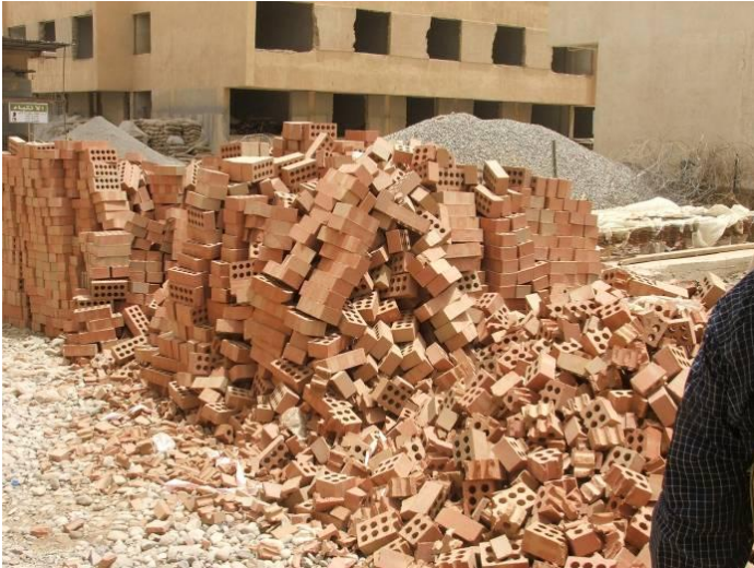
Site Photo 2. Construction bricks