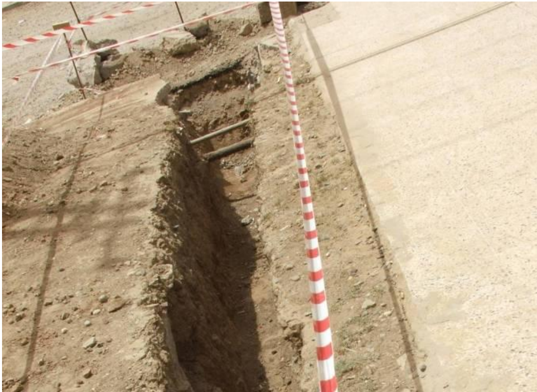
Site Photo 1. Excavation for underground utilities

At the time of the SIGIR site assessment, the contractor was performing general site work. Excavation for the underground utilities was performed and caution tape had been placed around the excavation (Site Photo 1).