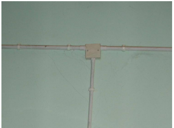
Site Photo 11. Building 6 interior wiring