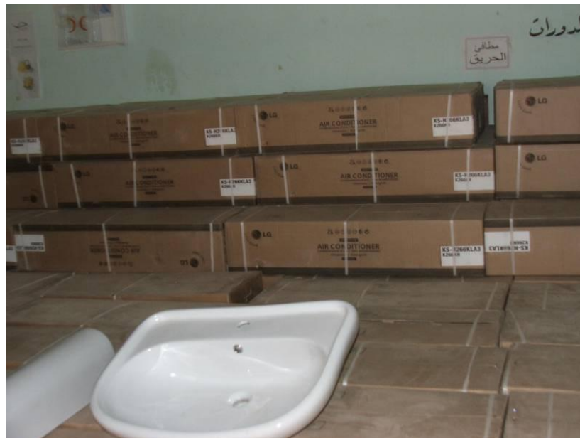
Site Photo 7. Stored materials in building 6

SIGIR noted that the contractor stored materials for the project on the first floor. The stored materials consisted of plumbing fixtures and a significant number of air-conditioning units (Site Photo 7).