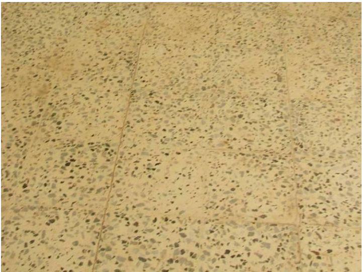
Site Photo 10. Tile flooring

As part of the renovation, the contractor replaced the tile floor. The floor was level with no apparent cracking or displacement (Site Photo 10). The contractor was in the process of installing new electrical wiring and conduit in the building. In accordance with the SOW, the contractor was surface mounting the conduit (Site Photo 11). The contractor was using junction boxes to join intersecting runs of conduit.