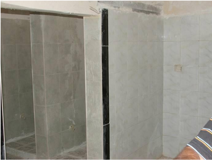
Site Photo 8. Tile replacement

At the time of the site assessment, the contractor had started renovation of the restrooms in building 6. The renovation consisted of replacement of the floor and wall tiles (Site Photo 8), re-plumbing the restrooms (Site Photo 9), and installation of new fixtures.