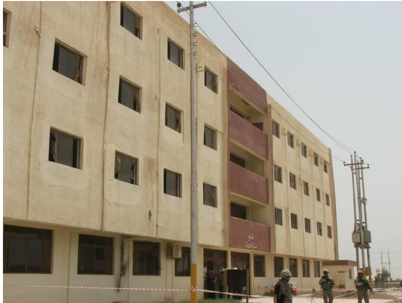
Site Photo 6. Building 6 exterior

During the site assessment, contractor personnel were on site and performing renovation work to the existing building (Site Photo 6). Based on discussions with the GRN Mosul Area Office representative, the contractor was performing work on all floors of the building. The clinic and common area would be located on the first floor, and the living areas would be on the remaining floors.