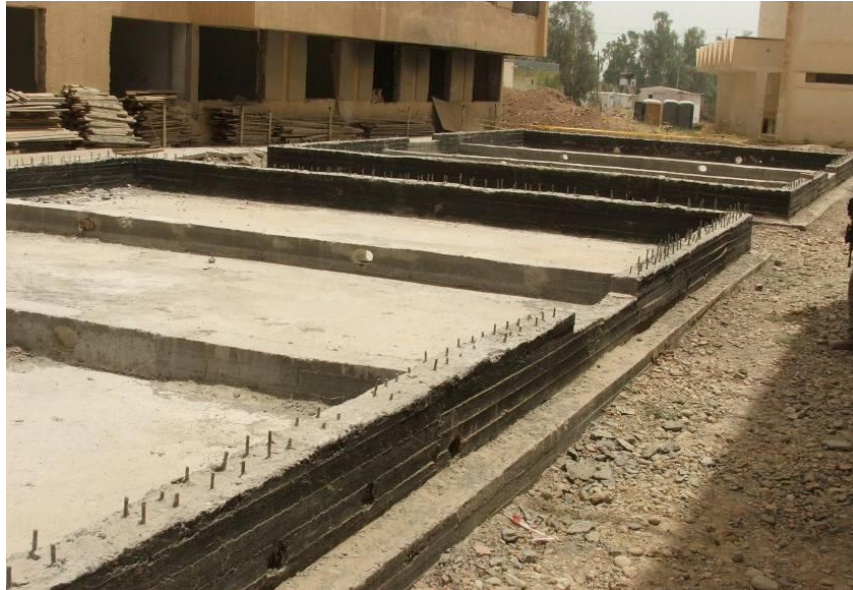
Site Photo 4. Latrine foundation and floor slab

At the time of the SIGIR site assessment, the contractor had constructed the foundation and the floor slab for the latrines (Site Photo 4).