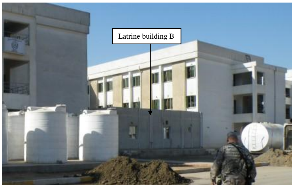
Site Photo 6. Latrine building B, between cadet barracks

In the latrine buildings, there was extensive vandalism and theft of fixtures including exhaust fans torn out of the windows (Site Photo 7), shower pipes bent beyond use (Site Photos 8), faucets removed from hand-and-foot washing stations and capped off (Site Photo 2), and toilet flush tanks torn off the walls. Site Photo 9 shows toilets at the time of turn over to the Government of Iraq (GOI) in May 2008. Site Photo 10 shows a toilet at the time of the site inspection on 25 November 2008. In a number of instances, the shower stalls in the newly built latrine buildings had shower head piping bent over in an