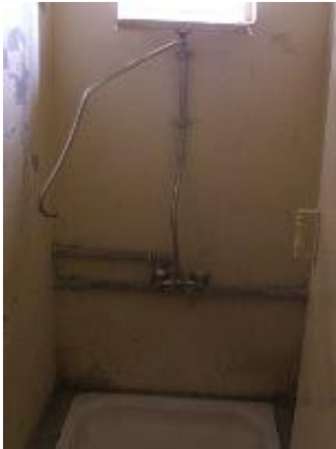
Site Photo 8. Vandalized showers - latrine building B