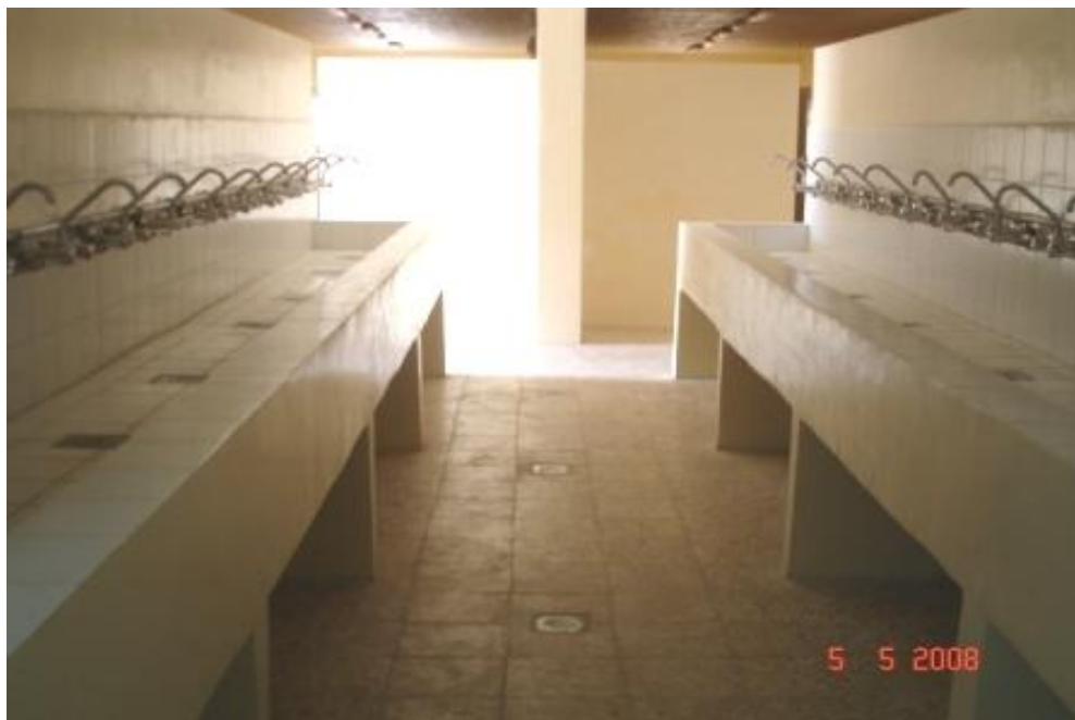
Site Photo 1. Latrine building A - May 2008 at turnover to GOI

The contract warranty clause provides that, "The Contractor shall also provide one-month of classroom and on the job training for all onsite equipment, and warranty and operations and maintenance oversight for a period of twelve months." However, the extensive vandalism damage and the widespread apparent theft of plumbing, heating, and ventilation equipment has rendered warranty provisions for the two new latrine buildings unenforceable (Site Photo 2).