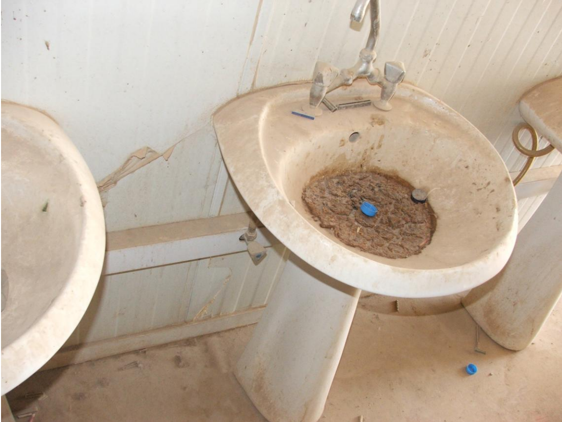
Site Photo 4. Latrine trailer at the time of the SIGIR site inspection on 25 November 2008.