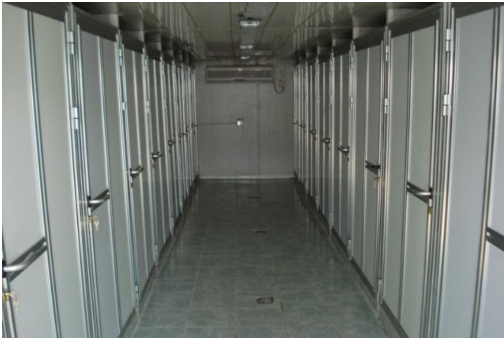
Site Photo 3. Ablution trailer at turnover to GOI

The latrine trailers were new when delivered and installed. Site Photo 3 shows a latrine trailer at the time it was delivered and installed. Site photo 4 shows a latrine trailer at the time of the site inspection on 25 November 2008.