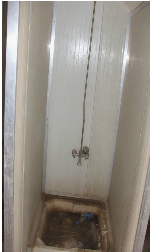
Site Photo 12. Condition of shower in latrine trailer.