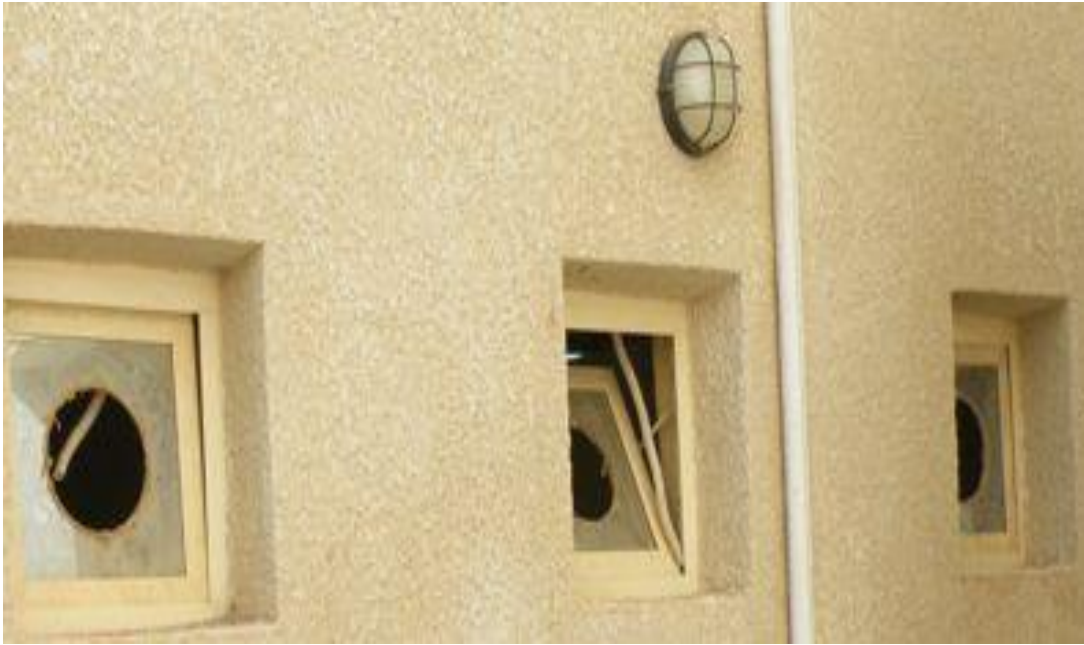
Site Photo 7. Exhaust fans were removed from new latrine buildings

unusable condition. The inside of the building had missing, or extensive damage to the plumbing fixtures.