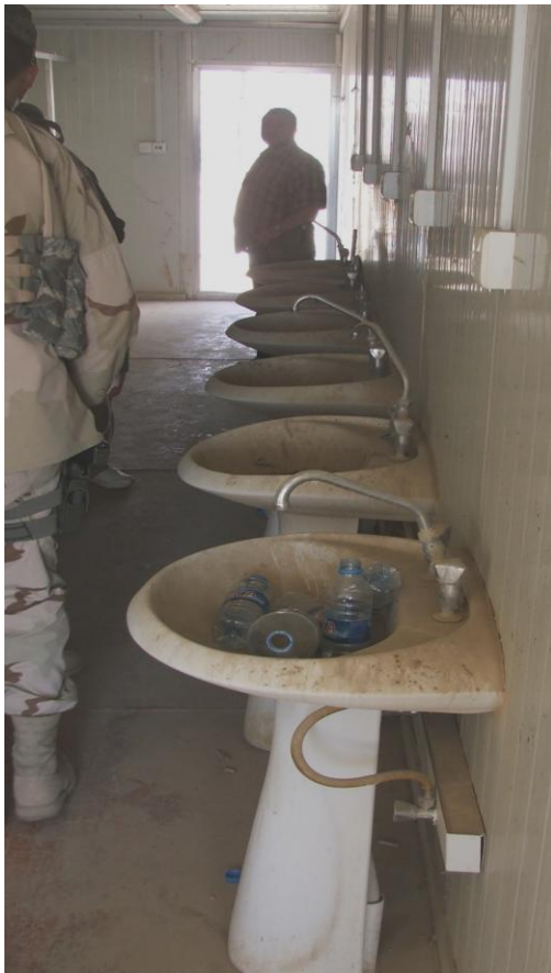
Site Photo 11. Condition of hand-and-foot washing stations in latrine trailer.

SIGIR inspectors observed the latrine trailers during the inspection on 25 November 2008 (Site Photo 11 and 12). The eight latrine trailers were particularly filthy, thereby creating a health hazard. In response to the vandalism, MNSTC-I and the GOI have taken actions to minimize future issues with respect to construction. These actions include building stand alone latrines separate form barracks to separate the plumbing and potential for water and sewage damage in living areas and transfer buildings to specific GOI agencies and organizations. Specific Iraqi ownership has improved the operations and maintenance of the facilities. Installing gravity-fed water systems where practicable to account for uncertainty in the electrical systems to ensure potable water is still available when needed.