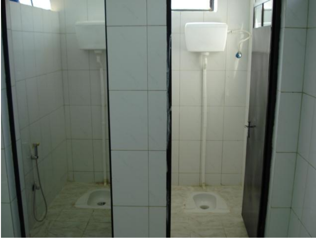
Site Photo 9. Toilet in new latrine building at turnover to GOI in May 2008