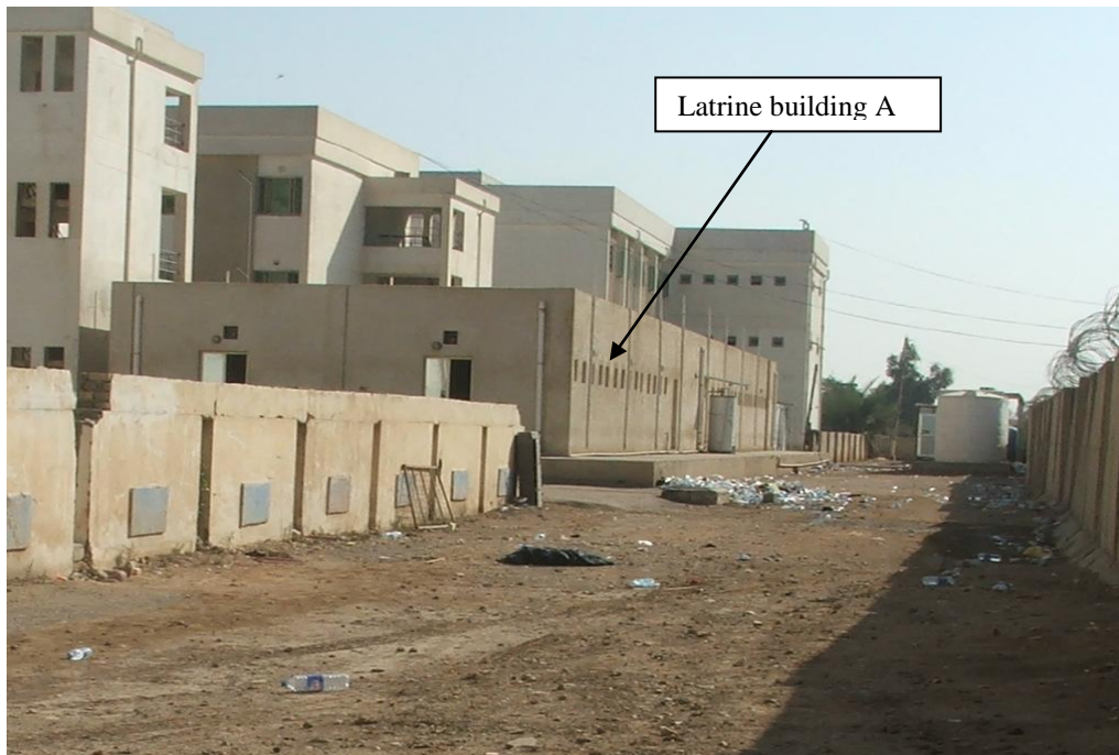
Site Photo 5. Latrine building A and its water heaters placed between cadet barracks