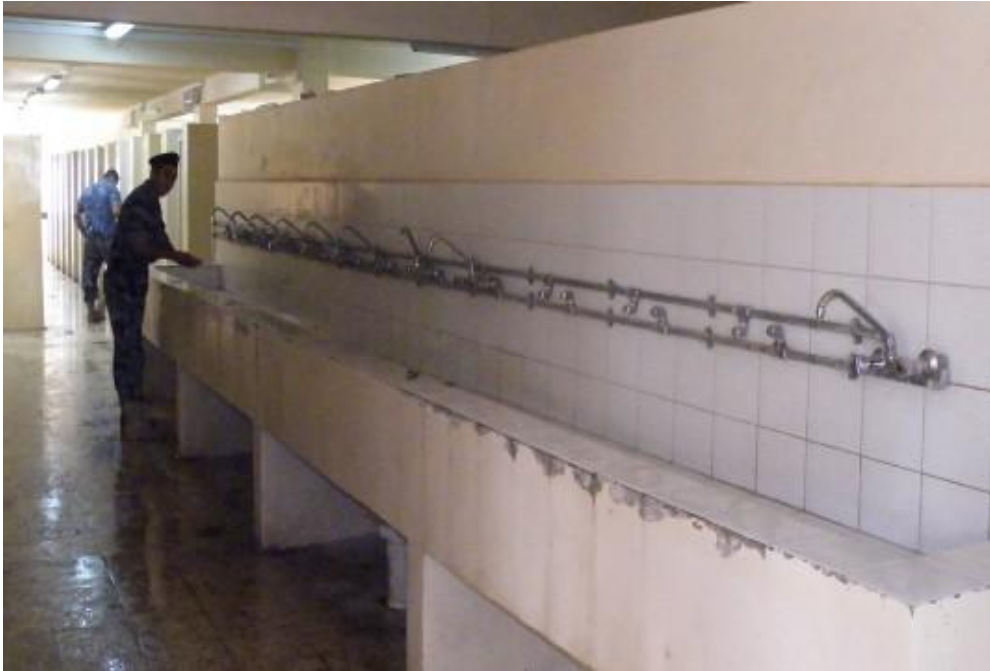
Site Photo 2. Latrine building A – November 2008 during SIGIR site inspection

The latrine trailers were new when delivered and installed. Site Photo 3 shows a latrine trailer at the time it was delivered and installed. Site photo 4 shows a latrine trailer at the time of the site inspection on 25 November 2008.