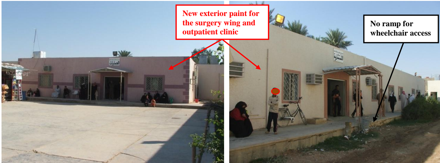
Photos 3 and 4. Exterior of the surgery wing and outpatient clinic buildings

The parking lot had no effective means of channelization or control of internal circulation of traffic. Vehicles were parked in a haphazard manner, which reduced the number of parking spaces available. The parking area was surfaced with dirt and gravel, and had no provisions for surface drainage. Because of the distance from the parking lot to the entrance and the dirt and gravel surface, patients are forced to traverse uneven muddy ground.