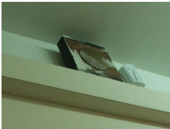
Site Photos 7 and 8. Installation of new wire molding, outlets, light fixtures and new main distribution panels (left) and careless over-painting of intercom system (right).