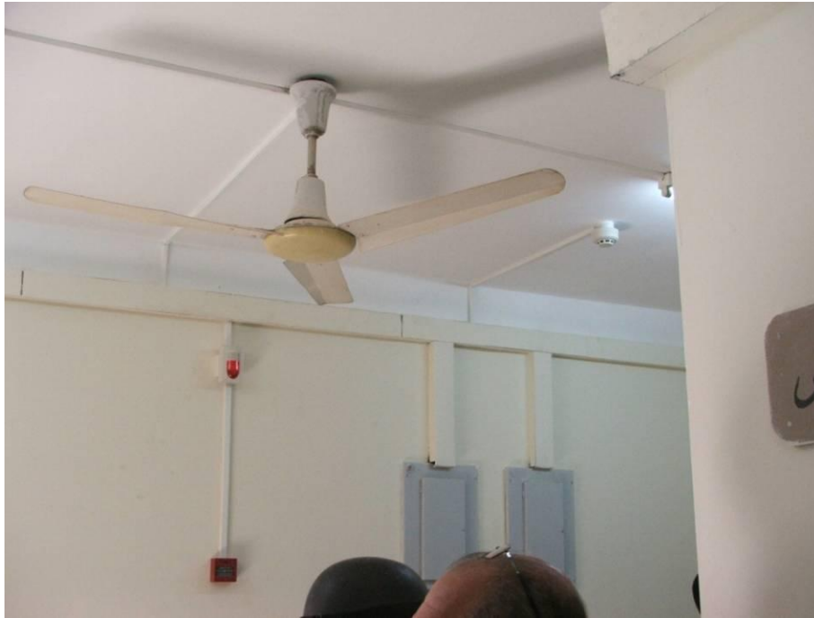
Site Photo 13. Installation of fire alarm system.