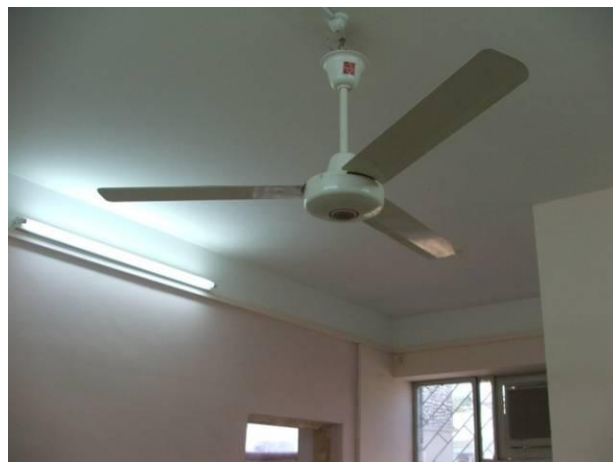
Photos 5 and 6. Views of the hospital administration building interior