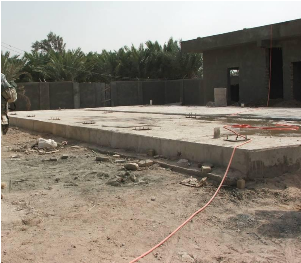
Site Photo 2. Water compact unit foundation