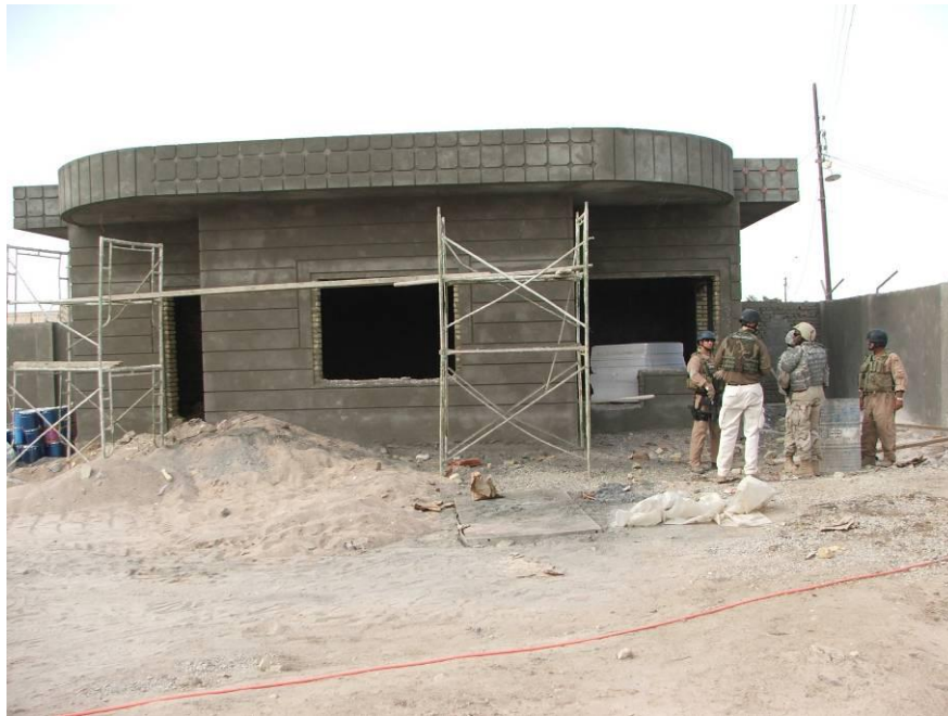
Site Photo 6. Operator building

At the time of the second site visit, the contractor had started construction of the operator building (Site Photo 6) and chemical building (Site Photo 7), including the installation of the crane (Site Photo 8).