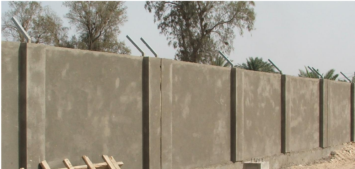
Site Photo 5. Close-up of Site Photo 4--required barbed wire not installed

At the time of the second site visit, the contractor had started construction of the operator building (Site Photo 6) and chemical building (Site Photo 7), including the installation of the crane (Site Photo 8).