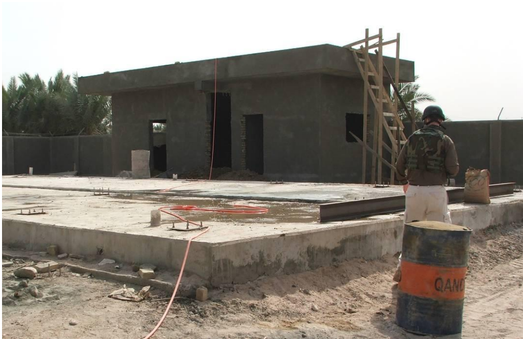
Site Photo 8. Crane placement