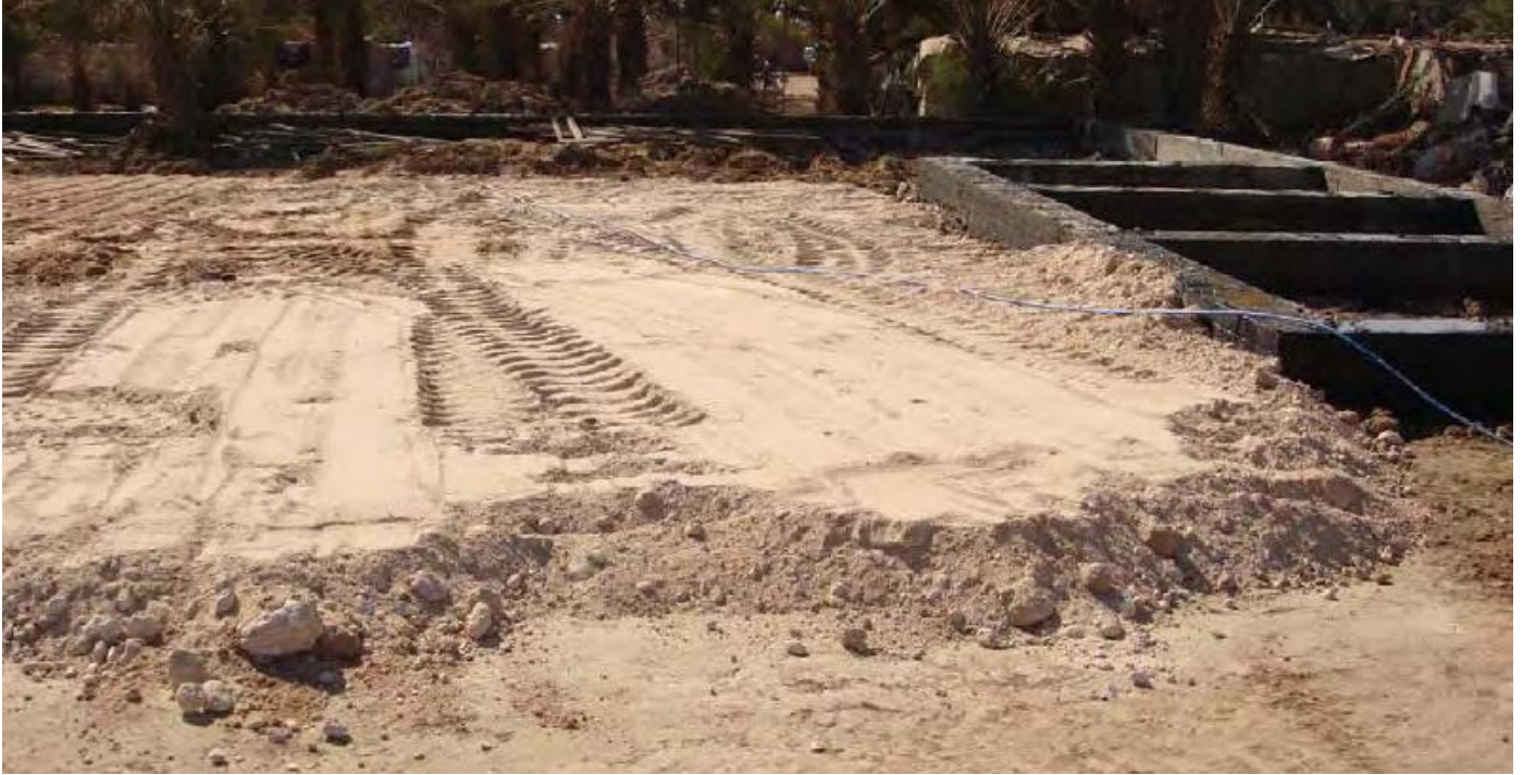
Site Photo 1. Spreading of sub base before compaction