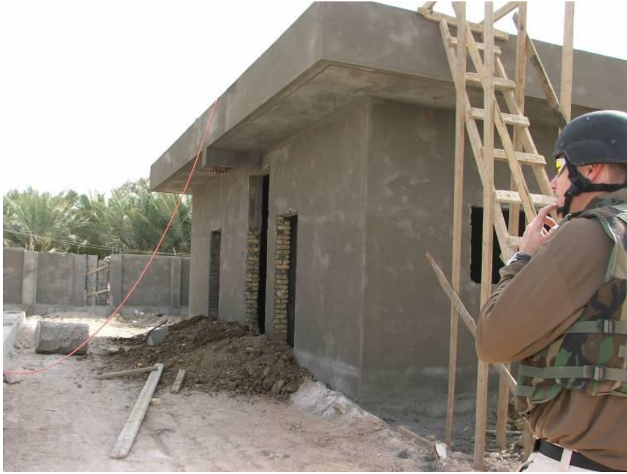
Site Photo 7. Chemical building