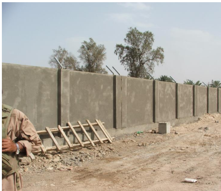
Site Photo 4. Perimeter wall

SIGIR observed significant work underway in the Al Ager WCU construction area. For example, for the security of the plant and its operators, the Statement of Work required exterior perimeter fencing, consisting of brick and topped with three strands of barbed wire. During the second site visit, SIGIR determined that the exterior site fencing was nearly completed (Site Photo 4), excluding the three strands of barbed wire (Site Photo 5).