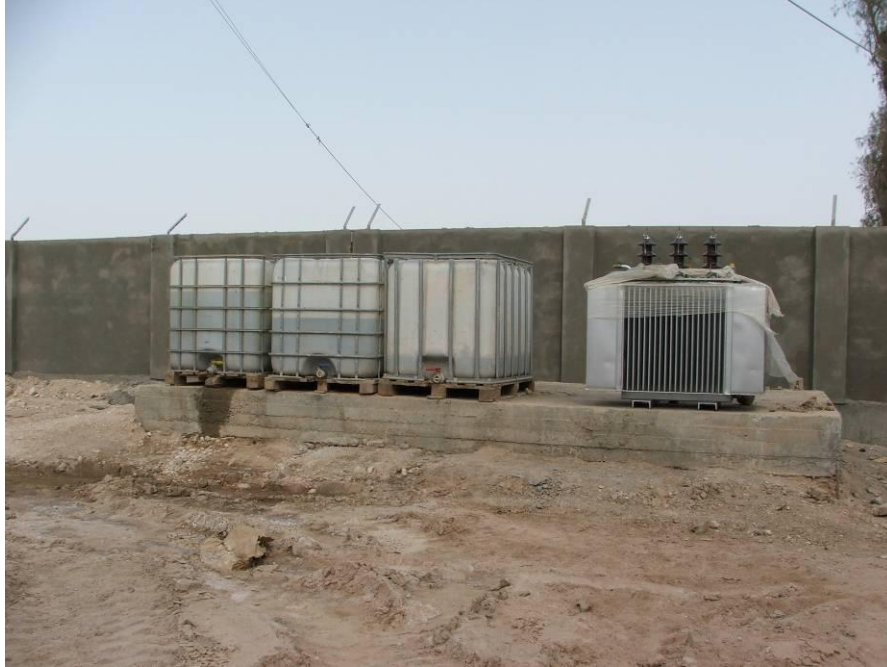
Site Photo 3. Future generator pad

No other significant work elements were completed prior to the site visit for the project.